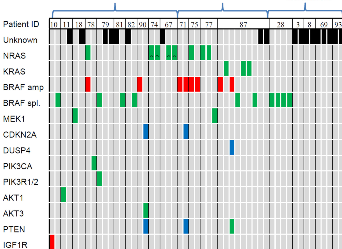
Figure 2. Heterogeneity of resistance mechanisms within individual patients with multiple biopsies Legend: Green: mutation; Red: amplification; Blue: deletion; Black: unknown