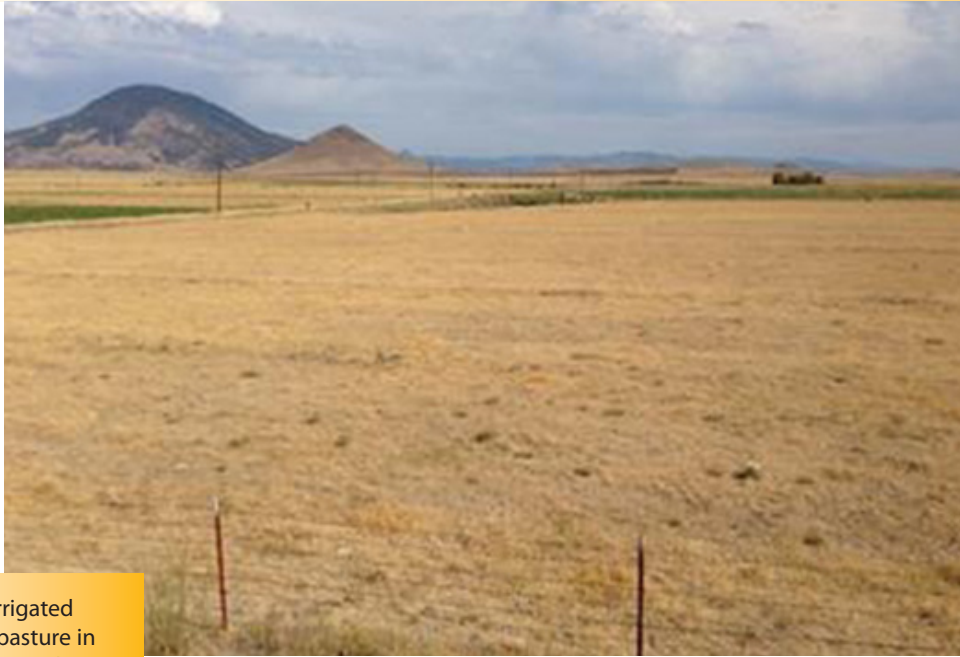
Figure 1. Irrigated tall fescue pasture in Shasta Valley, Siskiyou County, CA, after a season with only one spring irrigation, August 2014.

occasionally timothy ( Phleum pratense L.) in wetter sites. These cool-season grasses differ in drought tolerance, with studies ranking their drought tolerance, in order from highest tolerance to lowest, as tall fescue, orchardgrass, perennial ryegrass, and timothy (Waldron et al. 2002; Orloff and Putnam, unpublished data). Bromegrass species are another cool-season grass option for managing drought. Research has shown the yield of meadow brome and smooth brome to be less affected by deficit irrigation than tall fescue, orchardgrass, or perennial ryegrass (Waldron et al. 2002). Smooth bromegrass and timothy are better suited for intermountain and coastal areas of California and generally are not well adapted to Central Valley locations.