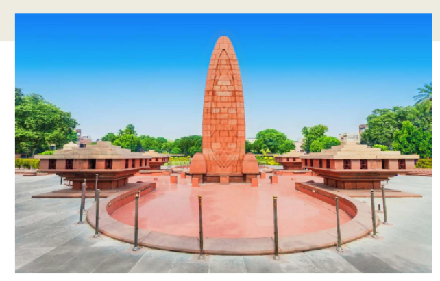
Current Jallianwala Bagh "Flame of Liberty" Memorial