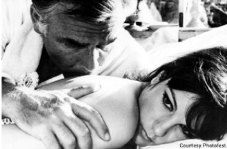
Figure 3. The Author as Voyeur: Portraying the Male Gaze

From voyeuristic detachment in long shots and pans to the reduction of distance in close ups, Pietrangeli's camera excels in producing in the spectator a sense of intrusion and violation. Let us take for instance the opening titles. The title sequence locates Adriana on the beaches of Ostia, where a circular pan of the landscape finishes with a slow pan up her body from her feet to her head, almost a kino-caress, followed by a reverse zoom which reveals her whole body. This lingering on the various parts of the actress as well as providing a full body shot of her underlines from the beginning of the film Adriana's "to-be-looked-at-ness," as she lies naked in her fetishistic and scopophilic glory. 324 Consequently, as if to give us what we think we want, in the very next scene, Pietrangeli shows Adriana as she is groped by her married boss at her job in a beauty salon. This scene serves to collapse the distance between the spectator and fetish-object by showing us the lurid potential consequences of our desire for Adriana, what would happen if the kino-caress were embodied. Yet let us return to the titles for a minute.