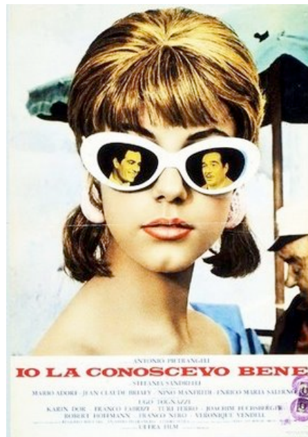
Figure 9. A Revealing Publicity Poster: The Spectator Reflected Back

viewer gains by consuming the film’s narrative. Leonardo Autera wrote in Bianco e nero a review of Io la conoscevo bene that the title is an example of pleonasm , a linguistic device characterized by redundancy and linguistic excess. 339 Which begs the question why Io when simply La conoscevo bene would have sufficed? This first person subject pronoun, Io , I, prominently beginning the title of the film, to whom does it refer? To the director, the critics, the spectator, the characters in the film? La , the third person feminine object pronoun, does it mean simply Adriana, or all actresses, be they divas or extras, or perhaps all women? As in the publicity poster below, Pietrangeli’s film reflects our “male” gaze back onto itself.