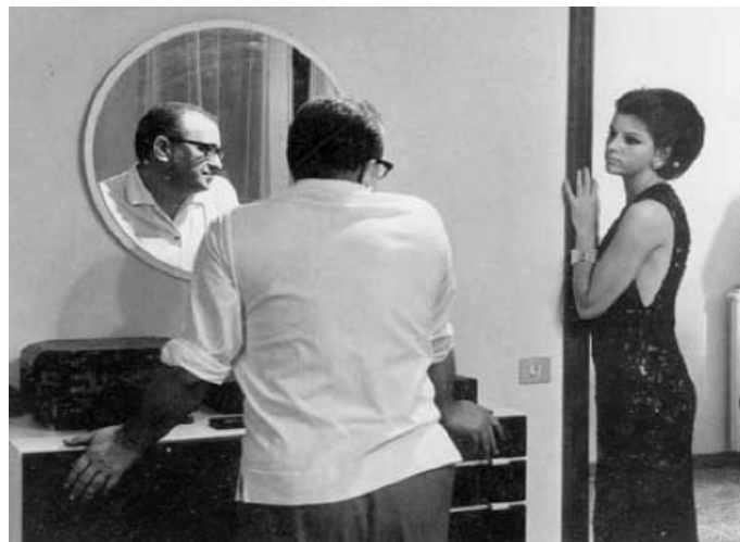
Figure 1. Pietrangeli in the Mirror

photo taken on the set of the film shows Pietrangeli looking at Stefania Sandrelli in the trappings of Adriana Astarelli. I have reproduced it again here below to emphasize that it is the director's reflection we see in the mirror, this mirror which serves as the screen, a metaphor for cinema itself. This photo is striking because while Pietrangeli studies the actress, the spectator sees him as well, so that we are presented with an equally incomplete and fragmented view of both director and actress. The film's, and hence the director's, epistemological authority is ultimately and most clearly undermined by the protagonist's suicide, with which Pietrangeli deconstructs his own narrative and with which Adriana who authors her own death. This operation affirms the filmmaker's failure to know his subject completely, a failure which throughout the film has served as the site of conflict that drives the plot of the film forward. This is a rare thing for a director to admit.