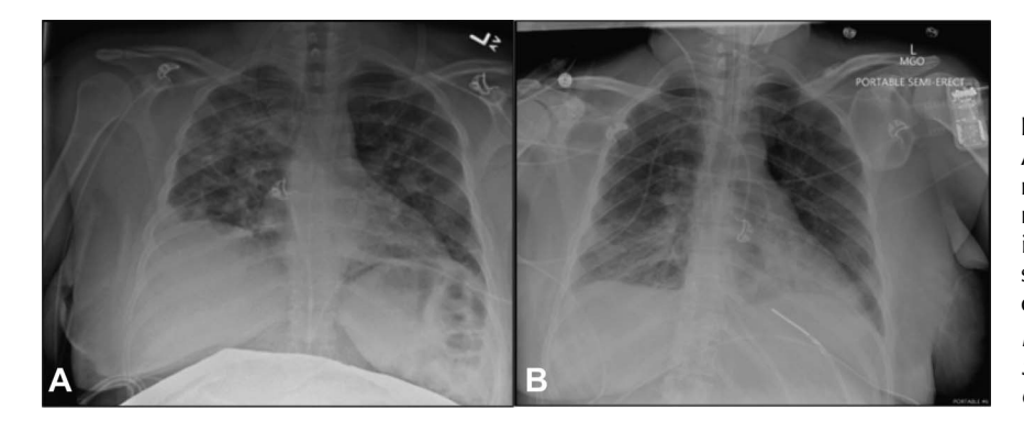
Fig. 2. Maternal chest radiography. A. Imaging on admission showed multifocal consolidations and reduced lung volumes. B. Repeat imaging on postoperative day 3 showed improved lung volumes and decreasing bilateral opacities. Blauvelt. Acute Respiratory Distress Syndrome in a Pregnant Patient With COVID-19. Obstet Gynecol 2020.

Concerns have been raised about worse COVID-19 outcomes with prolonged steroid therapy in the nonpregnant population.<sup>17</sup> However, the course of antenatal corticosteroids for fetal lung maturity is of short duration and is recommended in patients at less than 34 weeks of gestation at risk for preterm birth. Antenatal corticosteroids can be given in patients with diabetes after full consideration of the potential risks and benefits. In our patient, we felt that the benefits outweighed the risks given her very preterm gestation; she did develop hyperglycemia after antenatal corticosteroid administration (as high as 279 mg/dL), subsequently controlled with increasing insulin doses. Similarly, magnesium sulfate for fetal neuroprotection should be considered even in women with respiratory symptoms, though evidence is limited on how to monitor these patients for toxicity. Oxygen saturation and respiratory rate should be followed closely and dosage and volume adjustments made for patients with renal dysfunction or pulmonary edema. Care must be individualized, balancing known fetal benefits of antenatal corticosteroids and magnesium against hypothetical risks to the mother.18,19