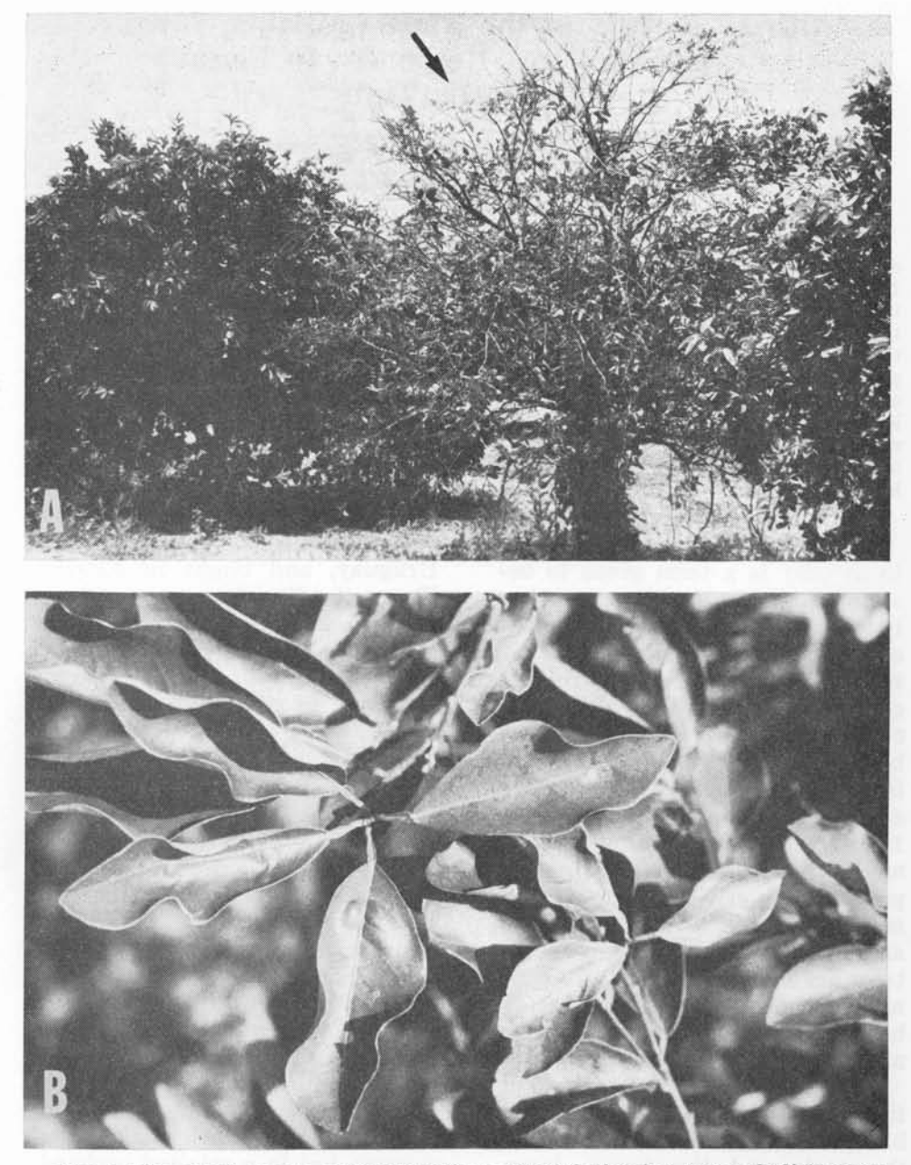
Fig. 1. Pera sweet orange on Rangpur lime rootstock showing severe declinio symptoms: A) tree showing severe twig dieback and vigorous shoots from rootstock; and B) dull green, wilted leaves.

Cultivars surveyed were Bahia, Baianinha and Pera sweet orange on Rangpur lime rootstock.