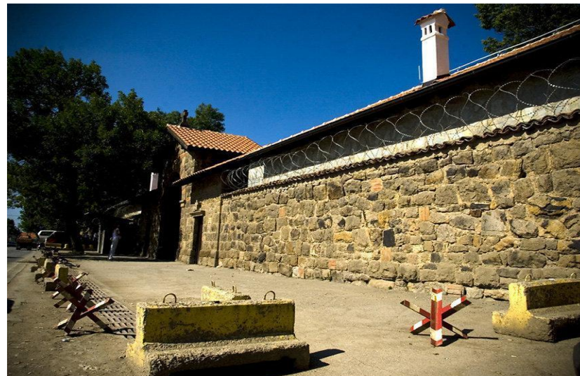
Fig. 2. Post-conflict traces remain in the urban landscape, speaking of a multi-ethnic population. A Serbian Orthodox Monastery (built in 1321), Gracanica: on UNESCO's World Heritage List. July 2010.