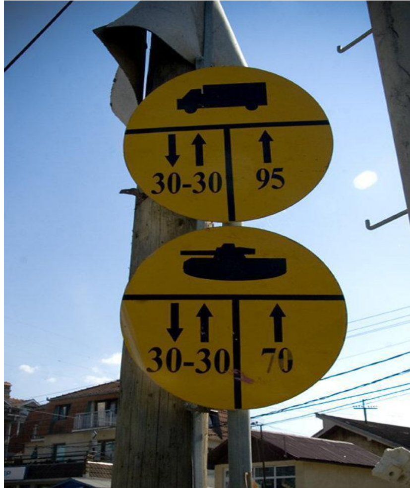
Fig. 1. Sometimes signs can tell stories better than people...A road sign in the outskirts of Pristina. July 2010.