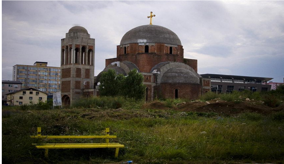
Fig. 3. Pristina, the capital city of Kosovo, was once part of Serbia, but then the Civil War broke out and divided not only the people who once lived happily as neighbors but also the places that they used to share together: the road, the sidewalk, the bench, the store, the bank...An unfinished Serbian Orthodox Church in downtown Pristina. July 2010.