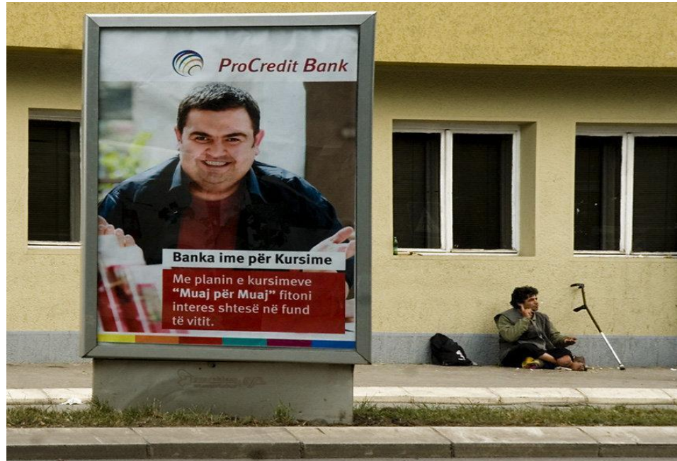
Fig. 5. Money ru(i)ns everything. ProCredit Bank: cheap loans. Pristina. July 2010.