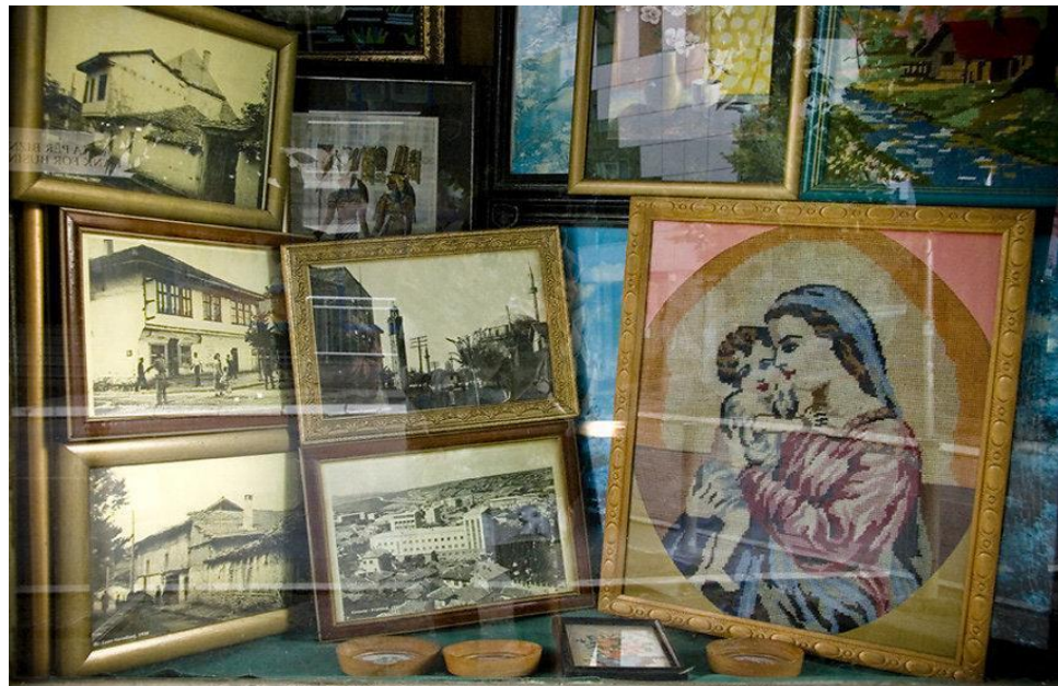
Fig. 8. The storefront of a framing shop in downtown Pristina. July 2010.