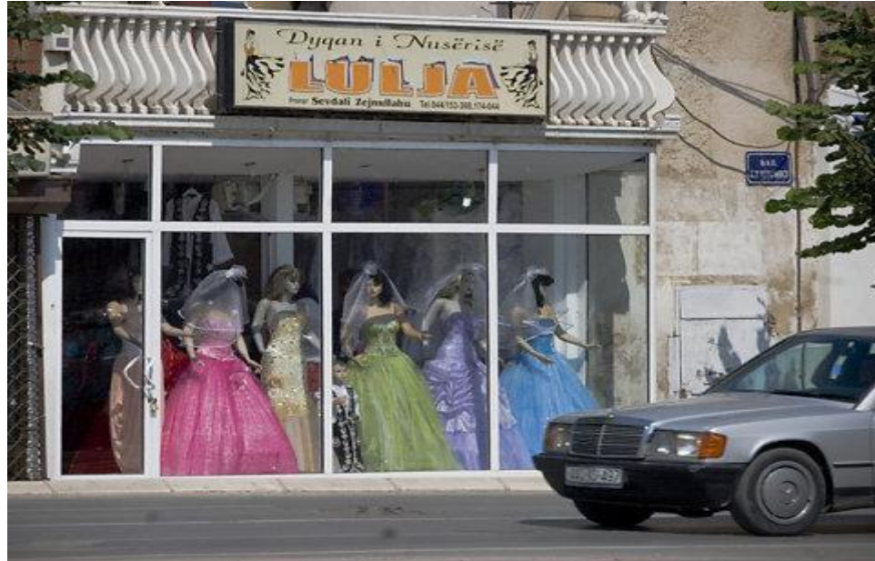
Fig. 9. A wedding dress store in downtown Pristina. July 2010.