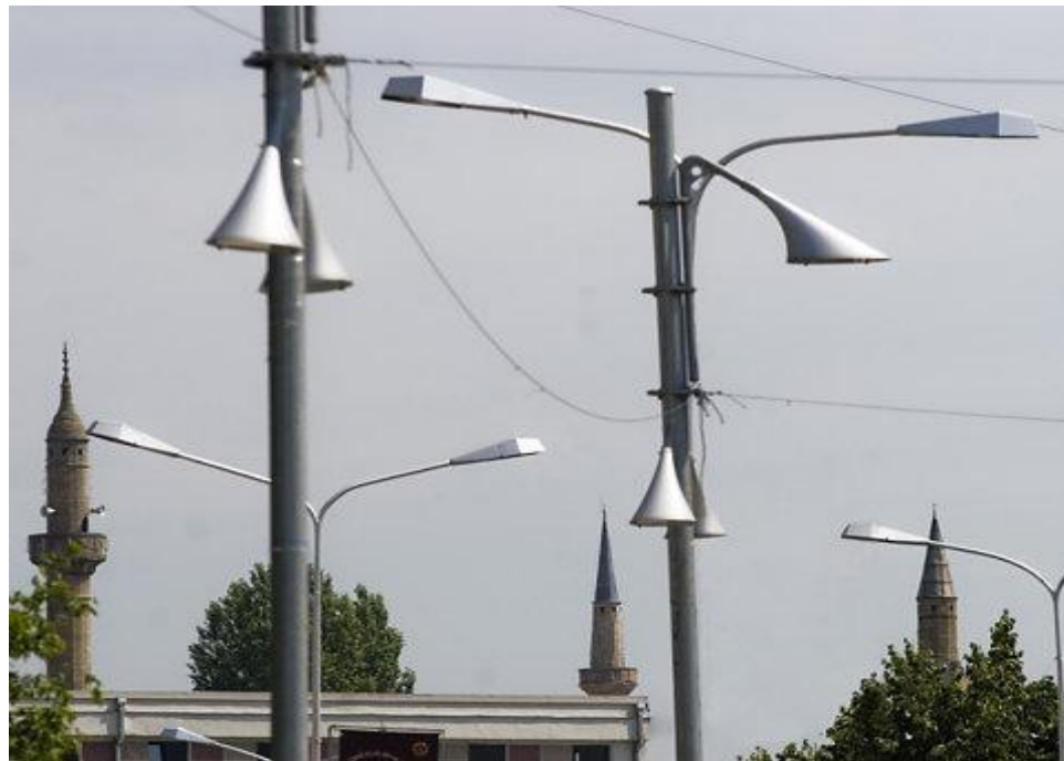
Fig. 10. Pristina horizon. July 2010.