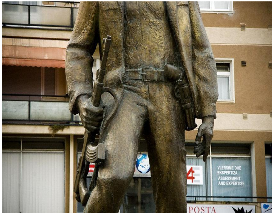
Fig. 4. Hidden in billboards, architecture, or public art, signs tell stories of a divided city. A monument from a post conflict period in downtown Pristina. July 2010.