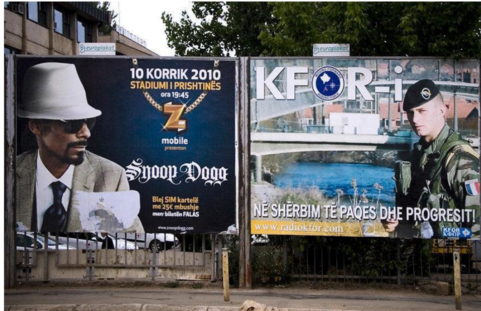
Fig. 7. Caught between its differences and similarities, the multi-ethnic population is trying to patch its colorful, peaceful coexistence back together...Between spectacle and resistance: Billboards: Snoop Dogg concert in Pristina; KFOR "in the service of peace and progress." July 2010.