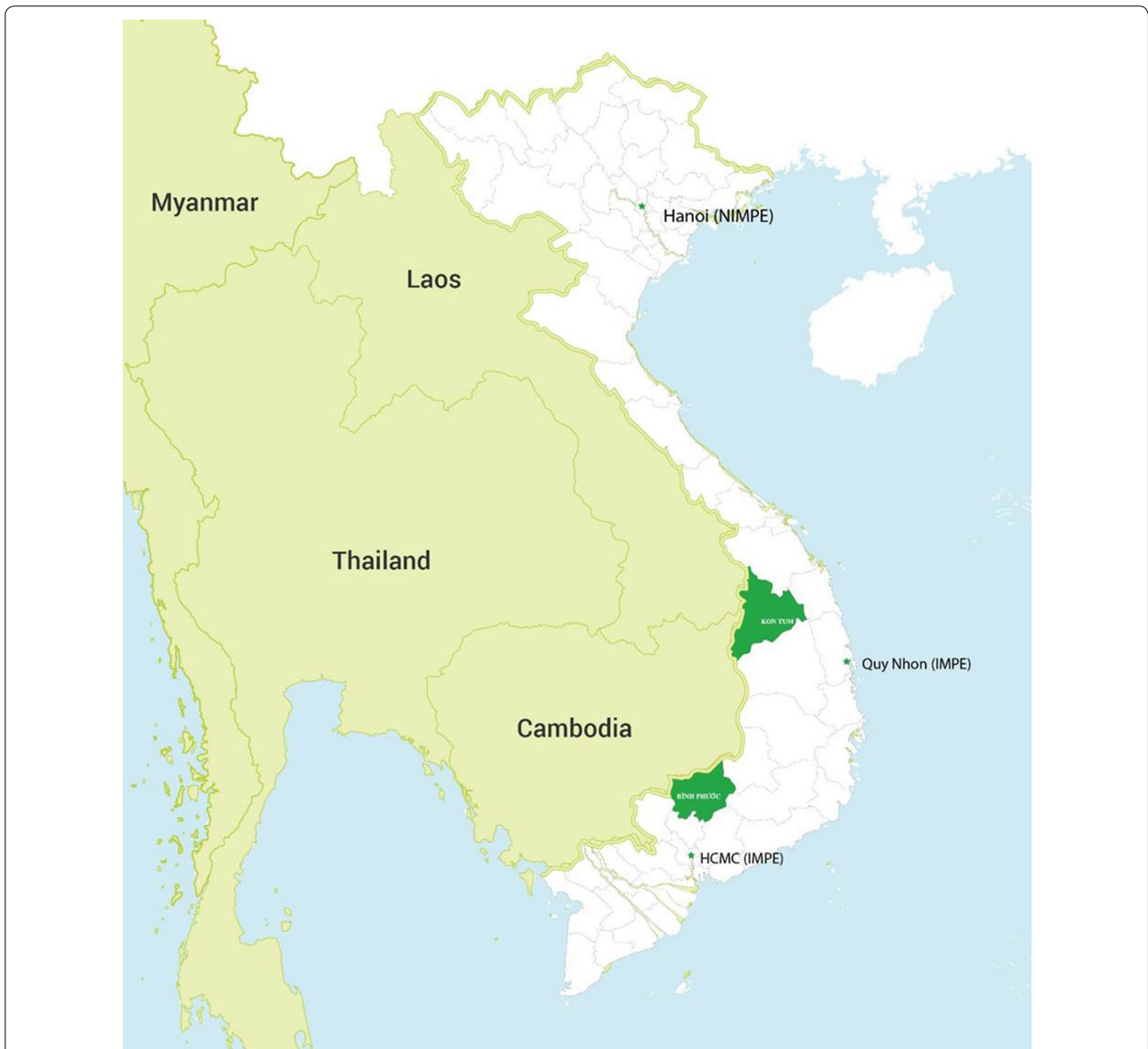
Fig. 2 Provinces of field study, qualitative studies December 2015–January 2016, Vietnam

P.f., Plasmodium falciparum ; P. v., Plasmodium vivax malaria