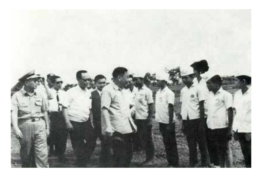
Figure 4. Chiang Ching-kuo (蔣經國, Jiang Jingguo), Premier of the ROC and son of Chiang Kaishek, visits a 4-T (4-H) chapter in Biên Hòa province, Vietnam.<sup>31</sup>

suggested that Vietnamese officials establish contests for the highest per-unit area of rice production, in which the "winning farmer will receive [an] award and will be asked to tell other farmers the ways and means by which he achieve[d] [his] goal." By incentivizing demonstration through informal competition, Taiwanese experts were hoping to create new information venues for rural Vietnamese farmers to learn from their own.