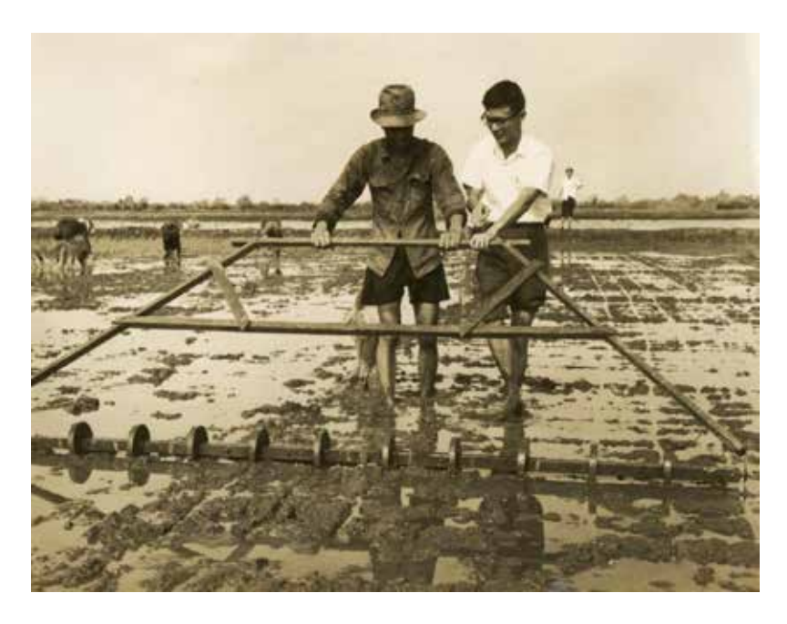
Figure 2. A Taiwanese technician teaching a Vietnamese farmer how to use an implement to mark rice spacing in order to maintain ideal distance while transplanting rice seedlings.<sup>20</sup>

Rationalization also extended to cultural practices, such as maintaining precise and consistent distance between rice seedlings to ensure enough room for growth without underutilizing much needed land. Taiwanese farmers introduced new agricultural implements that could aid Vietnamese farmers in easily marking distances through imprinting grids in the soil (figure 2).