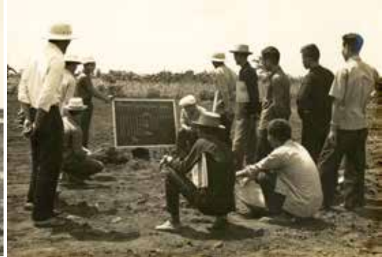
Figure 5 ( left ). National Taiwan University Professor C. I. Lin ( left ) demonstrates transplanting rice "shoulder to shoulder" with Vietnamese farmers. <sup>42</sup>

Figure 6 ( right ). As part of the agricultural extension and demonstration program, Taiwanese technicians trained selected Vietnamese farmers to serve as demonstration supervisors. This picture shows Taiwanese-trained supervisors teaching soybean-planting methods to other Vietnamese farmers. 43