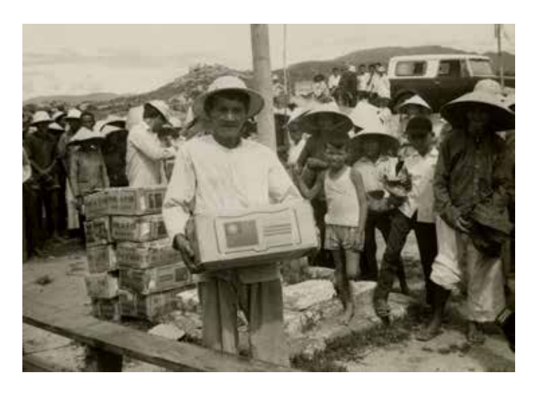
Figure 9. A Vietnamese recipient of Taiwanese aid. The box is adorned with the two flags of the Republic of China and Republic of Vietnam. 48

chemical composition, but was also a means to showcase the humanitarian actions and goodwill of Taiwanese assistance. Boxes containing vegetable seeds were adorned with flags of the ROC and RVN side by side, showing the origins of the gift along with partnership for the RVN peoples (figure 9).