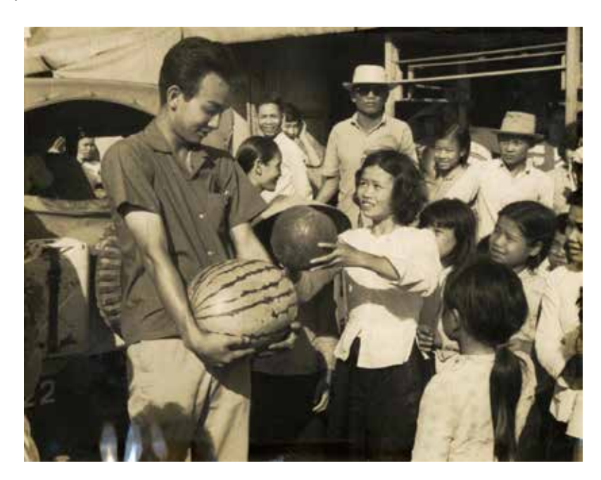
Figure 3. Photograph comparing the American variety "Dixie Queen" watermelon ( left ) at 14 kilograms (more than 30 pounds) introduced by the Taiwanese agricultural team compared to a native variety ( right ) in Định Tường. <sup>26</sup>

Taiwanese teams expanded beyond rice to include other food crops, including onions, carrots, garlic, sweet potatoes, watermelon, soybean, cabbage, lettuce, peanuts, sorghum, corn, and mung beans (figure 3). Varieties were sourced from countries throughout the Global North and South, such as the United States, Australia, and Korea. Experiment stations run by Taiwanese compared varieties, which could include up to twenty-eight varieties, as in the case of onions ranging from Texas Early Grano 502 to Early Lockyer Brown.<sup>25</sup>