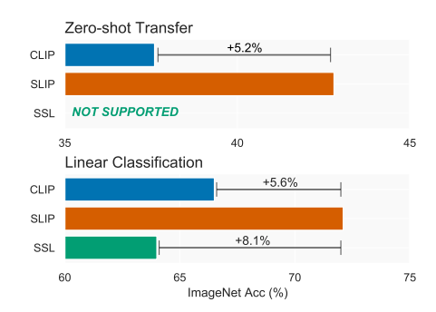
Figure 1: SLIP pre-training on YFCC15M. Combining image-only self-supervision and image-text supervision simultaneously improves zero-shot transfer and linear classification on ImageNet.

Both supervised and supervised pre-training today rely heavily on ImageNet (i.e. ImageNet-1K) [30], a highly curated dataset with particular idiosyncrasies and biases [35]. The YFCC100M dataset [33] was released in 2015 and remains the largest publicly-accessible collection of images. To date, the field of representation learning has found much less use for this dataset. On the other hand, the full ImageNet dataset of 14M images (i.e. ImageNet-22K) has become very popular for its role in training Vision Transformer models which require a larger amount of data than ImageNet-1K [10,1]. Why are uncurated datasets not more common in the study of representation learning? There are a few possible reasons. Most immediately, uncurated datasets also lack labels and so long as supervised pre-training