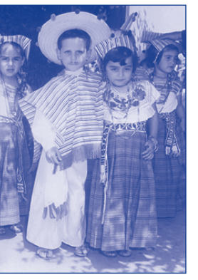
Film cover from Tijuana Jews

In the "Border Series" (Winter quarter), films of various perspectives and visual styles examined the intricate web of immigration and borders. The films included a moving family saga of Guatemalan indigenous migrants, El Norte ; a depiction of drug-trafficking "mules" in María , Llena Eres de Gracia ; and a look at everyday migrant life in transnational circuits in the documentary Más Allá de la Frontera .