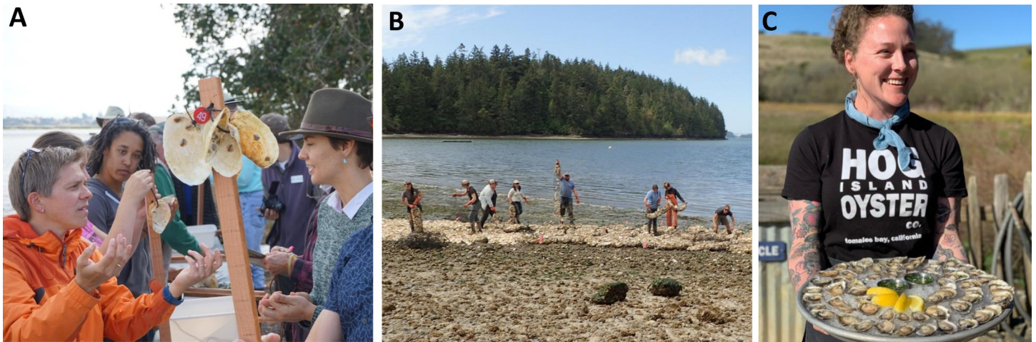
Fig 4. Examples of different approaches to implementing conservation aquaculture with Olympia oysters. A) Restoration with hatchery-raised juveniles led by a coastal management organization. Staff of the Elkhorn Slough National Estuarine Research Reserve, with community volunteers and partners, assemble stakes with clam shells bearing hatchery-raised juveniles. (Photo: B. Tougher). B) Community restoration. Staff members from the Swinomish Indian Tribal Community work with AmeriCorps volunteers from the Nooksack Salmon Enhancement Association to enhance habitat for Olympia oysters on Swinomish tidelands. (Photo: J. Barber); C) Commercial production and sale of Olympia oysters (Photo: M. Wilkinson, Hog Island Oyster Company). All individuals shown in images provided prior consent.

https://doi.org/10.1371/journal.pone.0252810.g004