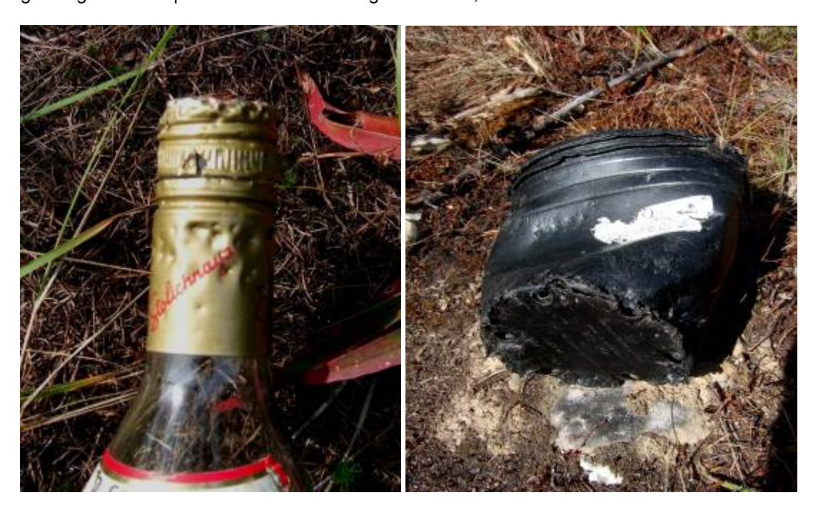
Photos 22 and 23: Pup "chew toys": vodka bottle top and plastic bucket.

At this site as well as around the den one can find pup digs, not unlike the ones a dog leaves in a yard. The youngsters also bring to the site "chew toys" from roadsides to gnaw on with their growing teeth. Pups will also chew on large branches, which will show abundant tooth marks.