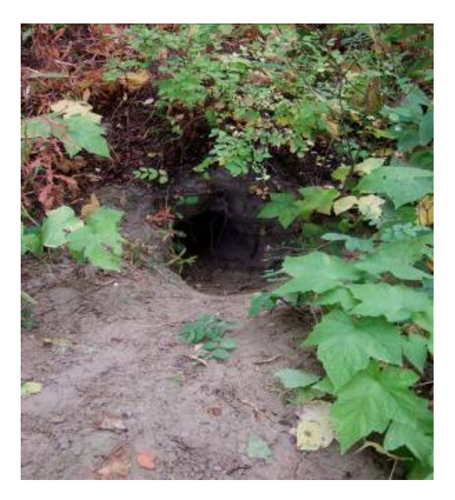
Photo 7: Den currently used, as seen in the lack of debris and smoothed substrate at the opening.

Whether the den is being used or has been abandoned can be determined by looking near the opening at the amount of fallen debris (leaves, twigs, pebbles), the roughness or smoothness of the substrate, the presence or absence of snagged hair on overhanging roots, as well as the freshness of tracks, scat, feeding sign, dislodged pebbles, scuffed moss on branches, and green and undisturbed vegetation.