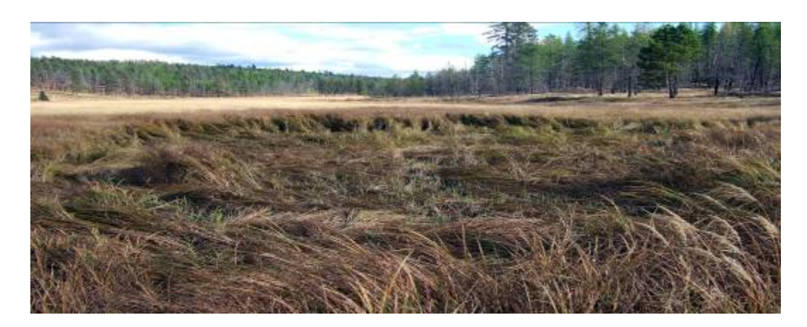
Photo 21: Part of a "crop circle" at a rendezvous site 2 km from a den.

As the pups are being weaned and starting to reach adulthood they are taken away to spots close to the den called rendezvous sites. These are often found in large and open flat areas such as meadows, often at the foot of a slope. Such sites will often be close enough to a thick conifer stand, which provides cover if necessary. Big litters can trample down large areas, which in tall grass may take the shape of "crop circles." Here, under the caretaking of a few elders, the pups play and sleep while the other adults hunt. Since the hunters bring back food for the pups, the site is usually littered with carcass parts—a veritable "bone yard."