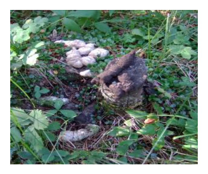
Photo 18: Scent-marking latrine atop and around a small stump found 50m below a den opening.

Carcass parts including bones, antlers, and hair are often brought by the animals to the den from a kill site and can be quite abundant. Skulls of ungulates are an especially useful find since they tell us the age and sex of the prey and therefore what influence the carnivores are having on a herd. A sure sign of a wolf kill of a large animal is the missing end of a leg bone, which wolves break with their powerful carnassials teeth in order to pull out the nutritious marrow. The pressure is often so heavy that the bone splits horizontally. These large marrow-less bones are a giveaway sign of wolf presence, distinguishing the species from other apex predators in the vicinity.