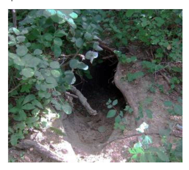
Photo 8: False den, as suggested by the thick layer of debris at the opening.

depth, and indeed even to draw a den's architecture. Such drawings may cast light on litter size and other features of pack life.