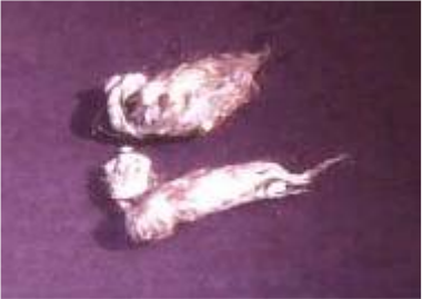
Photos 15, 16, and 17: Large size scats showing common J-hook shape, and tapered ends.