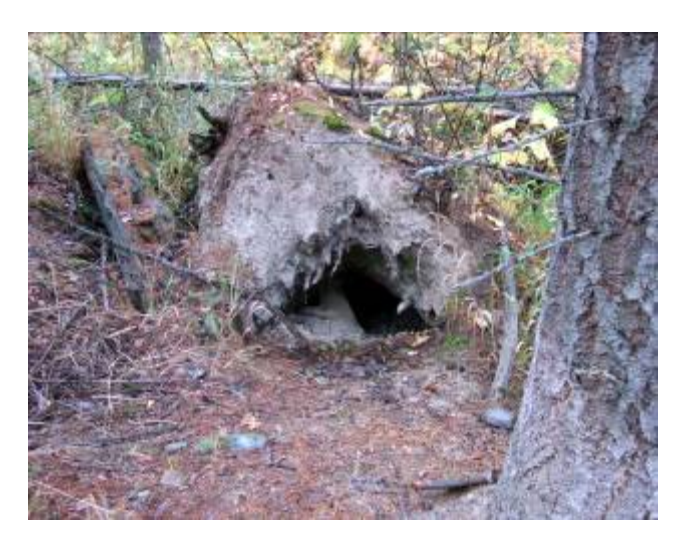
Photo 6: Typical wolf den beneath a fallen spruce tree. The thick layer of dead needles and other debris at the entrance suggest abandonment.

Whether the den is being used or has been abandoned can be determined by looking near the opening at the amount of fallen debris (leaves, twigs, pebbles), the roughness or smoothness of the substrate, the presence or absence of snagged hair on overhanging roots, as well as the freshness of tracks, scat, feeding sign, dislodged pebbles, scuffed moss on branches, and green and undisturbed vegetation.