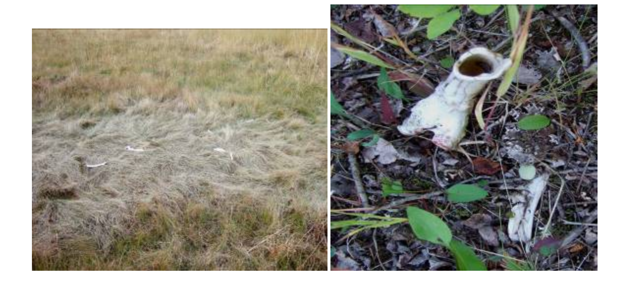
Photos 19 and 20: Kill site with scattered carcass parts, as well as the cracked and missing end of an elk bone with horizontal splits—a "wolf signature sign."

Carcass parts including bones, antlers, and hair are often brought by the animals to the den from a kill site and can be quite abundant. Skulls of ungulates are an especially useful find since they tell us the age and sex of the prey and therefore what influence the carnivores are having on a herd. A sure sign of a wolf kill of a large animal is the missing end of a leg bone, which wolves break with their powerful carnassials teeth in order to pull out the nutritious marrow. The pressure is often so heavy that the bone splits horizontally. These large marrow-less bones are a giveaway sign of wolf presence, distinguishing the species from other apex predators in the vicinity.