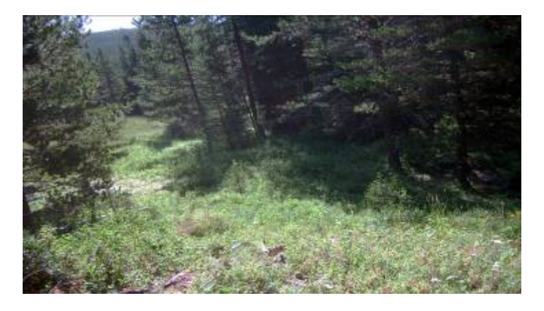
Photo 13: View from alpha male's observation post stretching 100m in each direction.

Above the den one may find an observation post overlooking a large open area where the alpha male stands protective watch while the alpha female nurses the pups. The spot is noticeable due to the path leading up to it, tracks, and the cleared and matted down substrate.