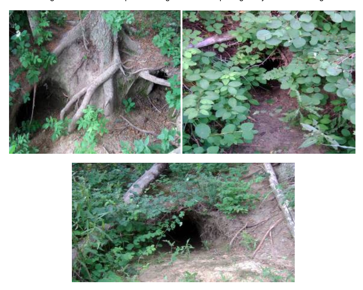
Photos 10, 11 and 12: Three openings of a single den "condo complex."

Some dens are spread over a large area and show multiple openings, suggesting a large litter size needing such a "condo complex." A large number of openings may also hint at longtime use.