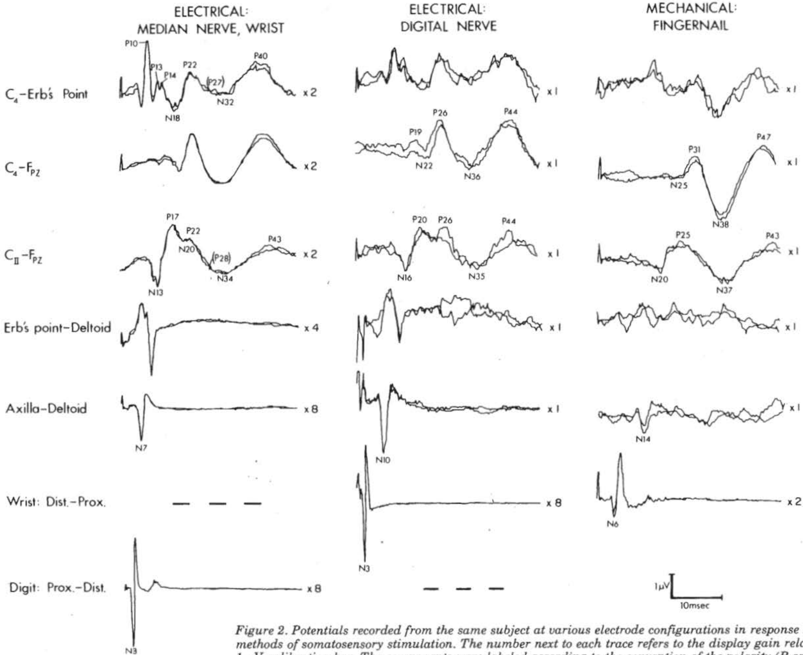
Figure 2. Potentials recorded from the same subject at various electrode configurations in response to three methods of somatosensory stimulation. The number next to each trace refers to the display gain relative to the 1-µV calibration bar. The components were labeled according to the convention of the polarity (P or N) at grid 1 of the differential recording site, followed by the average latency rounded to the nearest msec.