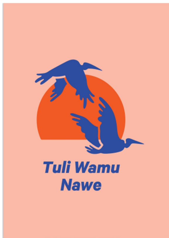
Fig. 2 The Tuli Wamu Nawe (translation “We are together with you”) brand logo appears on the uniforms of CHWs and CHRs and on other programme materials. It is designed to communicate the user-centred values of the programme and help clients recognise and trust different members of the contact investigation team when interacting in different settings

their diagnosis to contacts. This need and solution were identified through the human-centred design process. The booklet is available in Luganda or English and covers how TB spreads, how contact investigation can benefit participants, and how people diagnosed with TB can prepare for contact identification by considering all venues where they might have interacted with close contacts.