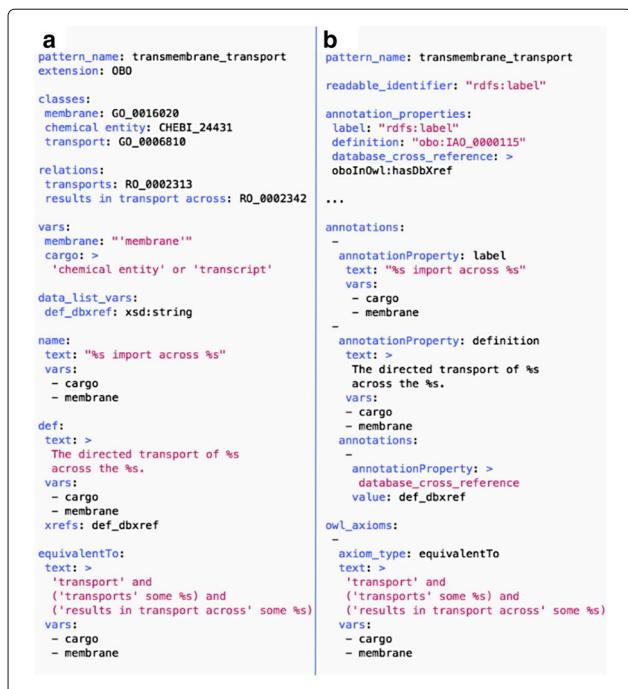
Fig. 1 DOS-DP for defining classes of transmembrane import (based on an example from the GO.) Panel A shows the DOS-DP using the OBO extension. Panel B shows the same pattern expressed using the core specification ( classes, relations and vars fields omitted from panel B for brevity). In Panel A , annotations are specified using dedicated fields ( def, name, xrefs ). The mapping from these to OWL annotation properties is specified in the OBO extension schema. This mapping is made explicit in Panel B , using an annotation_property dictionary and the annotationProperty field in axiom specifications under annotations . Throughout both versions of the pattern, paired fields text and vars specify printf text and fillers respectively. The value field is used with the data_list_var def_xrefs to specify a list database_cross_reference annotations on the definition

the class expression: "chemical entity' or 'transcript". The quoted OWL entity names in this expression are specified in the dictionaries. Both patterns also include an example of a variable that takes a data type as an input. The data_list_vars field specifies variables whose values are lists in which all elements share an OWL data type, specified in the value of the variable field. For example def_dbxref in Fig. 1 is specified to be a list of (XSD) strings.