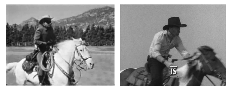
FIGURE 1 (above left): The Lone Ranger and Silver galloping (the rider is Clayton Moore). FIGURE 2 (above right): Walker and horse at full gallop (the rider is a stunt double).

In the introductory sequence, in an almost exact duplication of The Lone Ranger , there is a brief truck shot of Walker on horseback racing from left to right at a full gallop (see figures 1 and 2). Both characters are framed against