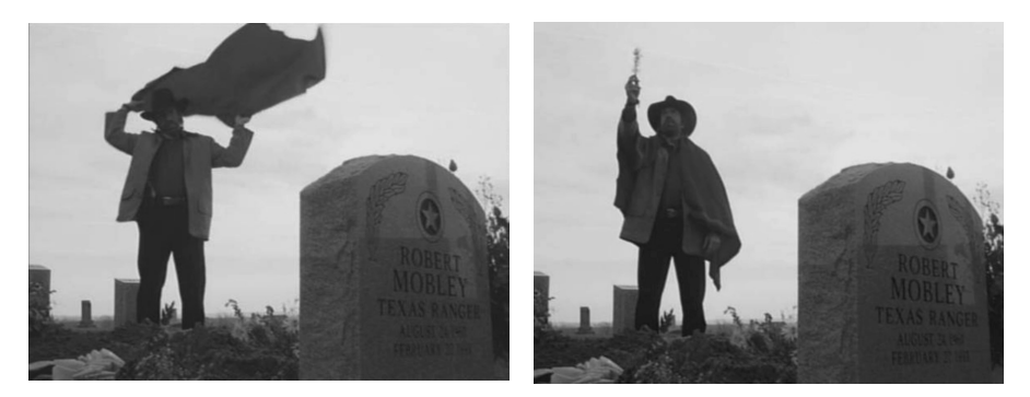
FIGURE 3 (above left): Walker tranforms himself into shaman by donning a red serape that is the equivalent of Superman's cape.

Walker dons a red serape that looks very much like Superman's cape (see fig. 3). The camera angle could scarcely get any lower; he is framed against the