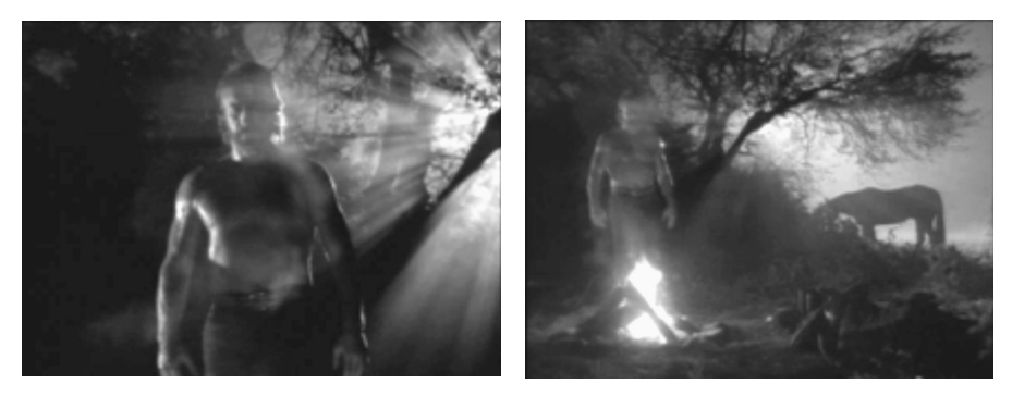
FIGURE 7 (above left): Rays of moonlight illuminate Walker from behind. The backlighting indicates his godlike stature; his horse too is backlit by moonlight. FIGURE 8 (above right): Walker prepares to "firewalk."

head is backlit by moonlight, creating a halo effect. A montage takes shape as three images fade into one another: first Walker's face, then the fire, and then flashbacks of some unspecified American Indians (probably Plains Indians) doing a sacred dance to traditional music. Colors become increasingly hotter as the camera (the viewer) draws closer to the fire. The viewer now sees inside Walker's head, witnessing visions of his Native ancestors. This transformative ritual again is analogous to Clark Kent stepping into a telephone booth. Walker continues to meditate by the fire, putting himself in a trancelike state, like a yogi. His eyeline does not match the previous shots: when the camera violates the 180-degree rule, it suggests a godlike point of view, since a human being cannot be in two places at once. Faux Native music in the background becomes progressively louder, building to a booming crescendo.