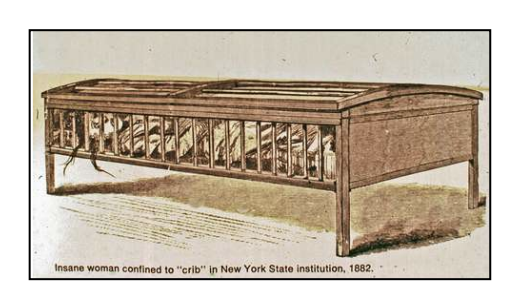
Figure 3.3. "Insane Woman Confined to "Crib" in New York State Institution, 1882." The hospital is also famous for its invention of the Utica Crib, a small slatted enclosure for subduing and keeping patients, Insane woman confined to "crib" in New York State institution , 1882; Western Illinois Museum: Preserving the History of West Central Illinois ; Western Illinois Museum; Web; 2 Feb. 2012.

For Melville, the carceral institution's capacity to psychologically impress and "validate[] the republic's ideology," places it on par, as a representation of America,