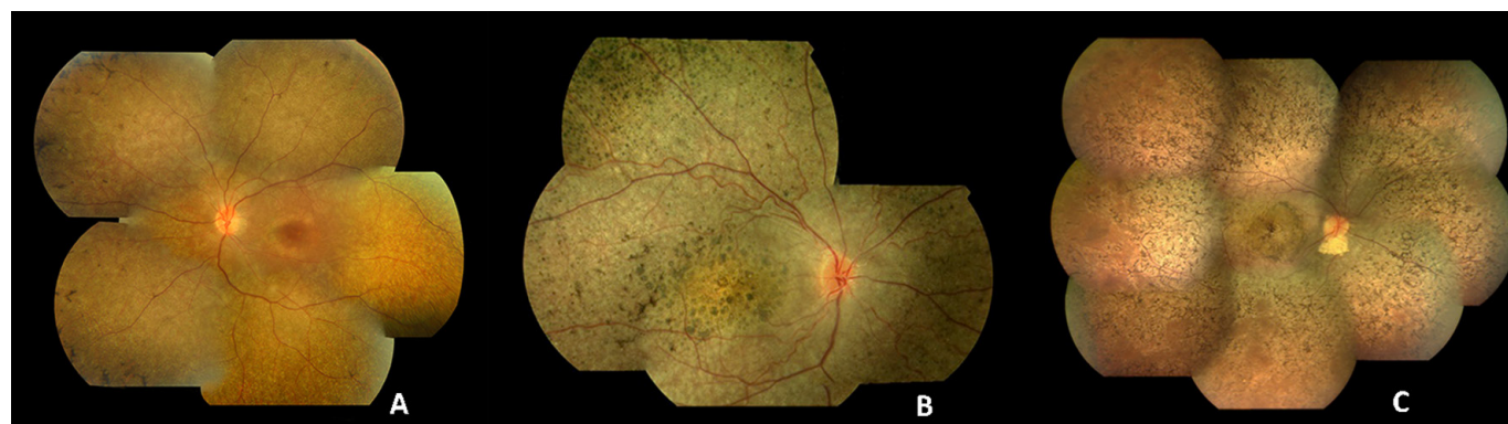
Figure 2 Colour fundus photographs of patients with recognisable LCA/EOSRD clinical phenotypes. (A) RPE65 -retinopathy, associated with a blonde fundus, peripheral, white punctate lesions and normal central macular appearance in keeping with central preservation of outer retina. (B) CRB1 -retinopathy characterised by nummular pigmentation, periaerterolar sparing of the RPE and macular atrophy. (C) RDH12 -retinopathy with characteristic dense intraretinal pigmentation and macular atrophy with pigmentation and yellowing. EOSRD, early-onset severe retinal dystrophy; LCA, Leber congenital amaurosis; RPE, retinal pigment epithelium.

Disease mechanisms and interventional approaches have been explored in several animal models of GUCY2D -LCA. Initially, gene replacement was investigated using an HIV1-based lentiviral vector in a naturally occurring chicken model and showed improved optokinetic reflexes and volitional visual behaviour. 28 Subsequently, multiple groups have had therapeutic success in