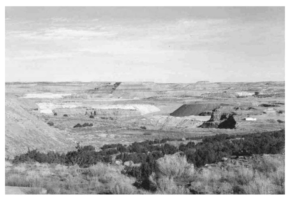
FIGURE 2. The Jackpile Mine, as it appears looking north one mile southeast of Paguate Village. "These were the hills northwest of Cañoncito. . . . The sandstone and dirt they had taken from inside the mesa was piled in mounds, in long rows, like fresh graves" (Ceremony 241, 245).