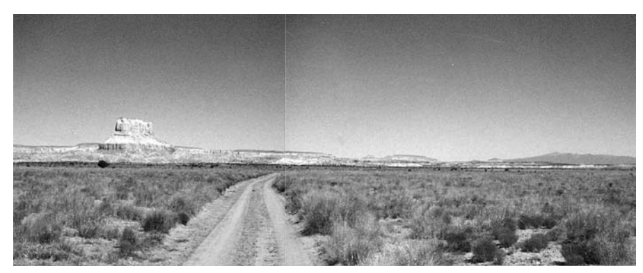
FIGURE 1. Looking north-northwest from the front gate of the Marmon ranch, a few hundred yards south of the southwest corner of the Laguna Reservation, where Harley picks up Tayo at the beginning and where Tayo stands before going to find Ts'eh at the Dripping Springs near the end. To the left is Pa'to'ch Butte, "standing high and clear; months and years had no relation to the colors of gray slate and yellow sandstone circling it" (220); to the right is (blue) Mt. Taylor; exactly halfway between them, as seen from this spot, is the break in the line of mesa, "where the mesa plateau ended in crumbling shale above the red clay flats" (220), which leads to the Dripping Springs, where Tayo reencounters Ts'eh: "T'm camped up by the spring,' she said, pointing at the canyon ahead of them. 'Here, this way. I'll show you'" (221).