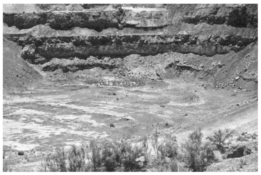
FIGURE 3. Looking down into one of the Jackpile pits. "They had enough of what they needed, and the mine was closed. . . . They left behind only the barbed-wire fences, the watchman's shack, and the hole in the earth" (Ceremony 244).