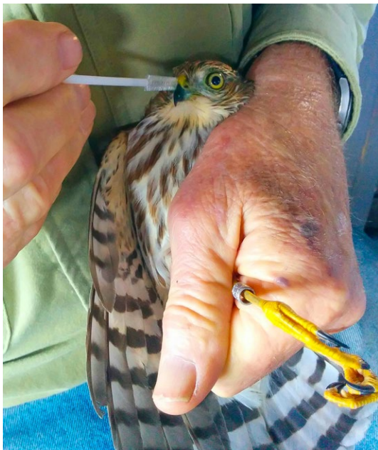
FIGURE 2 A juvenile migrating sharp-shinned hawk having its beak swabbed for prey DNA after the banding process at a migration monitoring station.

We extracted DNA from each brush tip using the QIAamp DNA Mini Kit (QIAGEN Inc.) with a modified protocol. After 20 \mu\text{l} proteinase K and 600 \mu\text{l} buffer AL was added, vortexed, and incubated for 15-min, all liquid was transferred from the 1.5 ml screw-top centrifuge tube to a 2.0 ml safe-lock centrifuge tube to allow space for 600 \mu\text{l} of 100% ethanol. Following buffer washes, DNA was eluted into 30 \mu\text{l} of molecular grade \text{H}_2\text{O} twice (60 \mu\text{l} \text{H}_2\text{O} total). The purpose