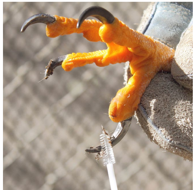
FIGURE 3 A captive raptor having its talons swabbed for prey DNA as part of our controlled study

We swabbed migrating sharp-shinned hawks ( Accipiter striatus ; n = 285 ) and merlin ( Falco columbarius ; n = 41 ) during fall of 2015 that were trapped by the Golden Gate Raptor Observatory in the Marin Headlands, CA, USA. All individual raptors were trapped by dho-ghazzas, which are passive nets that collapse upon impact, making contact with