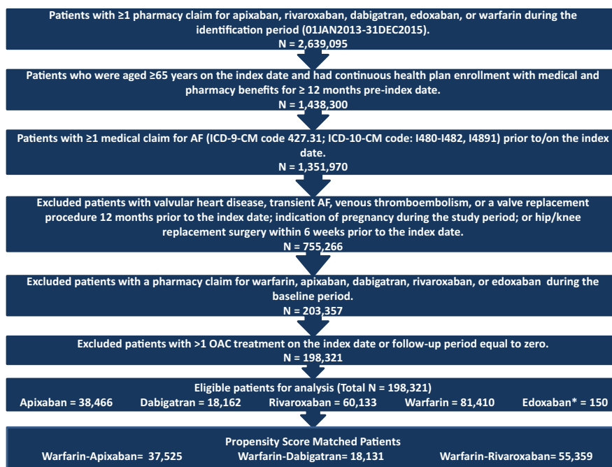
Fig. 1 Patient selection criteria

*Edoxaban was not included in the analysis given the small sample size.