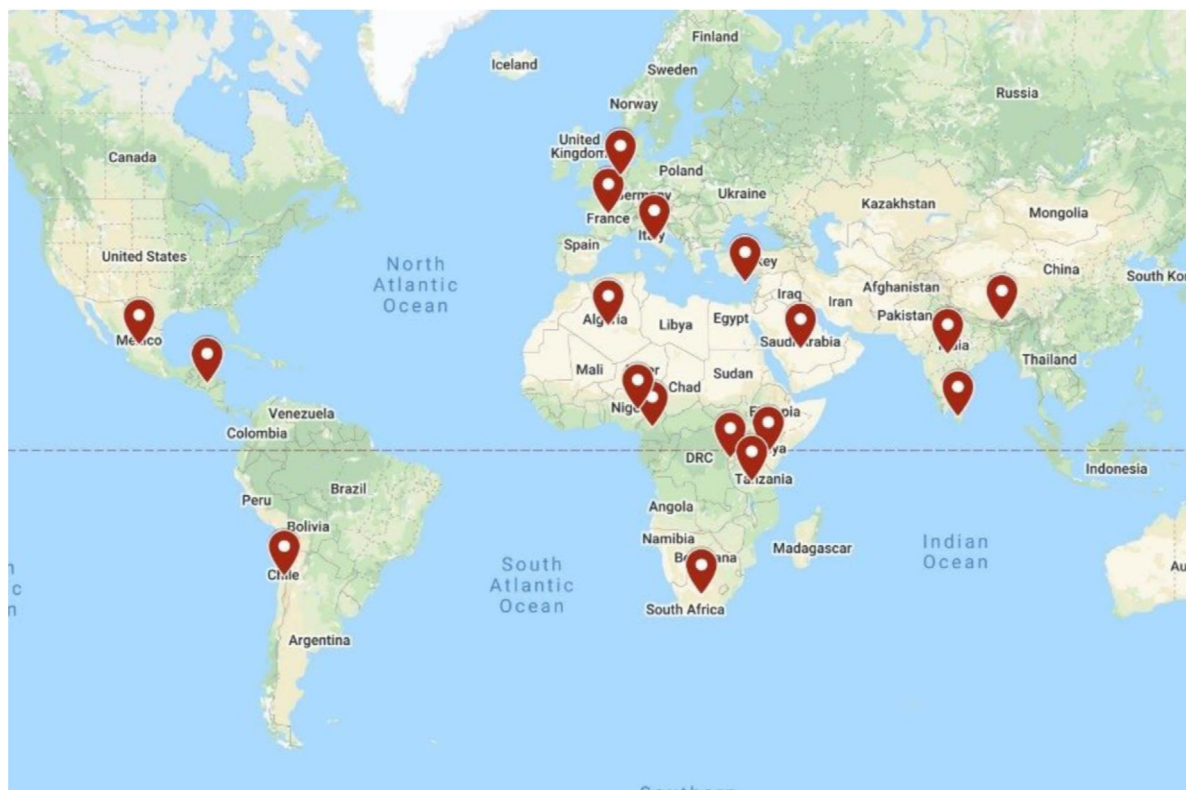
FIG 1. The map demonstrates the countries from which radiologists were surveyed in this study.

What are you doing to change clinical operations to cope? (can select multiple options) Of 23 total responses, 23 (100%) responded “Reduce