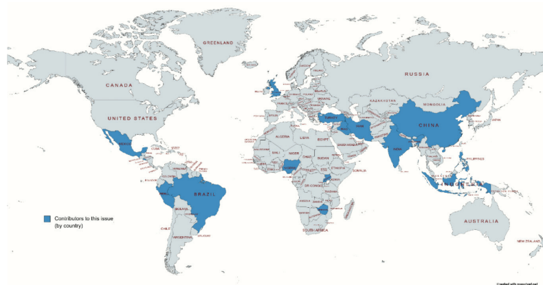
Figure 1. Map of contributing nurse authors' countries.

Eighteen submissions were received from 16 countries across Latin America, Africa, Europe and Asia (see Figure 1). Three were research-based and 15 were personal narratives on the psychosocial impact of COVID-19 on the nurses, colleagues, patients and families. Three narratives were from oncology nurses working with cancer-related NGOs locally or in one case, internationally (see Table 1). Table 2 presents the HDI, total population, total cancer cases in 2018 and percent GDP spent on healthcare for each country. The number of COVID-19 cases for each country from February–December 2020, with peaks, is displayed in Figure 2.