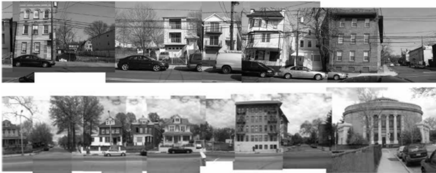
Figure 1: Housing and Institutional Buildings in Upper Clinton Hill

The following photos of vacant homes on Seymour Avenue in Upper Clinton Hill display the condition of typical vacant properties in the neighborhood. 105 Some vacant homes are relatively well maintained, but others are in deplorable shape.