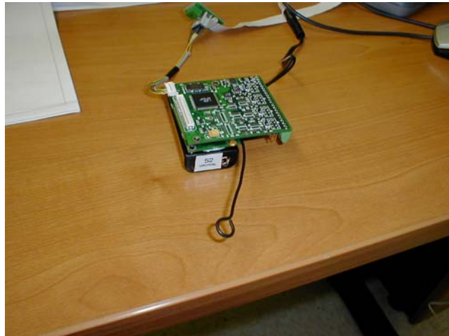
Figure 1. A mote with a vibration card

The design of the software subsystem for wireless data acquisition is quite challenging. In the rest of this section, we describe how we design a self-configuring wireless data acquisition system which allows rapid, reliable and time synchronized delivery of many channels of structural response to a base station. Our software subsystem is built on top of TinyOS, the operating system for the motes.