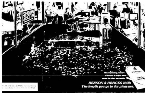
Figure 1 Hurdles: hot coals. (Benson & Hedges 100’s. The length you go to for pleasure. Philip Morris. 1993. Accessed 24 July 2002. Bates No. 2040711554/1574. http://legacy.library.ucsf.edu/tid/wyj72e00 )

Hurdles showed the difficulties of getting to the smoking section, implying that smoking sections were excessively burdensome, and that B&H made the difficulty worthwhile. The “hurdles” included walking a tightrope high above a busy street, crossing a crocodile filled pond on stepping stones, and walking across a bed of burning coals (fig 1). 18