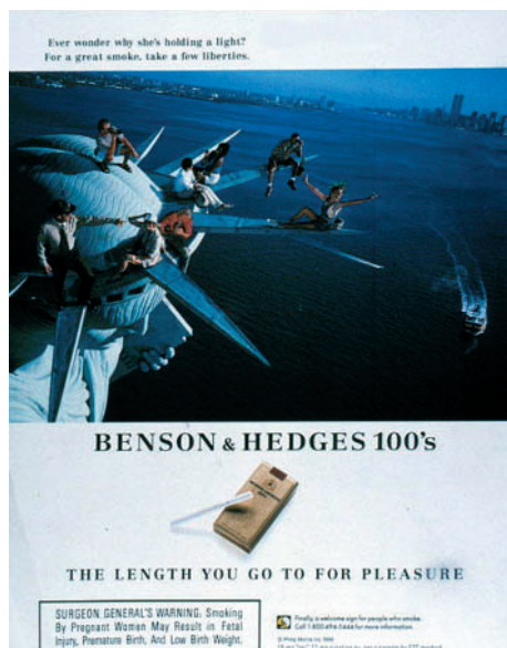
Figure 3 Creative solutions: Statue of Liberty.

advertising and the development of new products, to allay people's fears about the well known health risks. Such efforts generally focused on "low tar" cigarettes that implied reduced exposure to toxins. 21–23