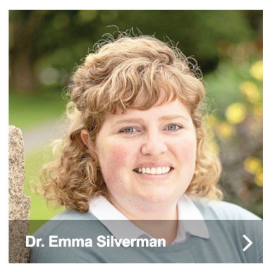
Mellon Fellow in the Legacy of Monuments and Memory