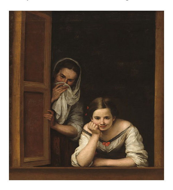
Figure 3. Bartolomé Esteban Murillo, "Mujeres en la ventana"

is displaying her upper torso, leaning over the window, in a curious position with a slight grin. This demonstrates a playful and youthful connection to the public world.