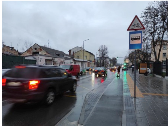
Figure 32. Bohdana Khmel'nyts'koho Street, Photo: Зручне місто

These neighborhoods are adjacent to residential areas and often that results in limited investment in those communities, while the city center thrives. With projects like these, which come into neglected areas like Pidzamche in Lviv or Podil in Kyiv, creating usable hubs and venues for