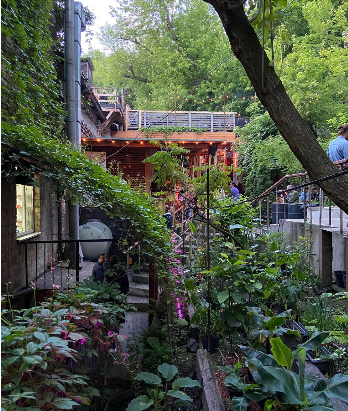
Figure 28. Closer Courtyard.

CANactions festivals also utilize DIY Urbanism to temporarily convert abandoned spaces into functional spaces for events. Doing so, they bring attention to these areas to locals and visitors from abroad, often sparking interest in development. One focus for CANactions has been