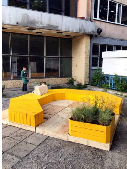
Figure 23 ReZavod Parklet

ReZavod in Lviv, while self-funded by its owners and business, works on projects with various stakeholders. One recent project at the ReZavod site was sponsored by the Lviv City Council and a number of local and international NGOs, such as GIZ and City Institute. The businesses at ReZavod along with city council, created street furniture and parklets in front of the factory (Figure 22 & 23). In addition to creating an outdoor public space on the street for local residents, this was an effort to bring more attention to the old factory building and show how new cultural centers can better connect to their urban environment. In Lviv, adaptations such as parklets, need to be approved by city planning authorities, which is why communication and collaboration is necessary.