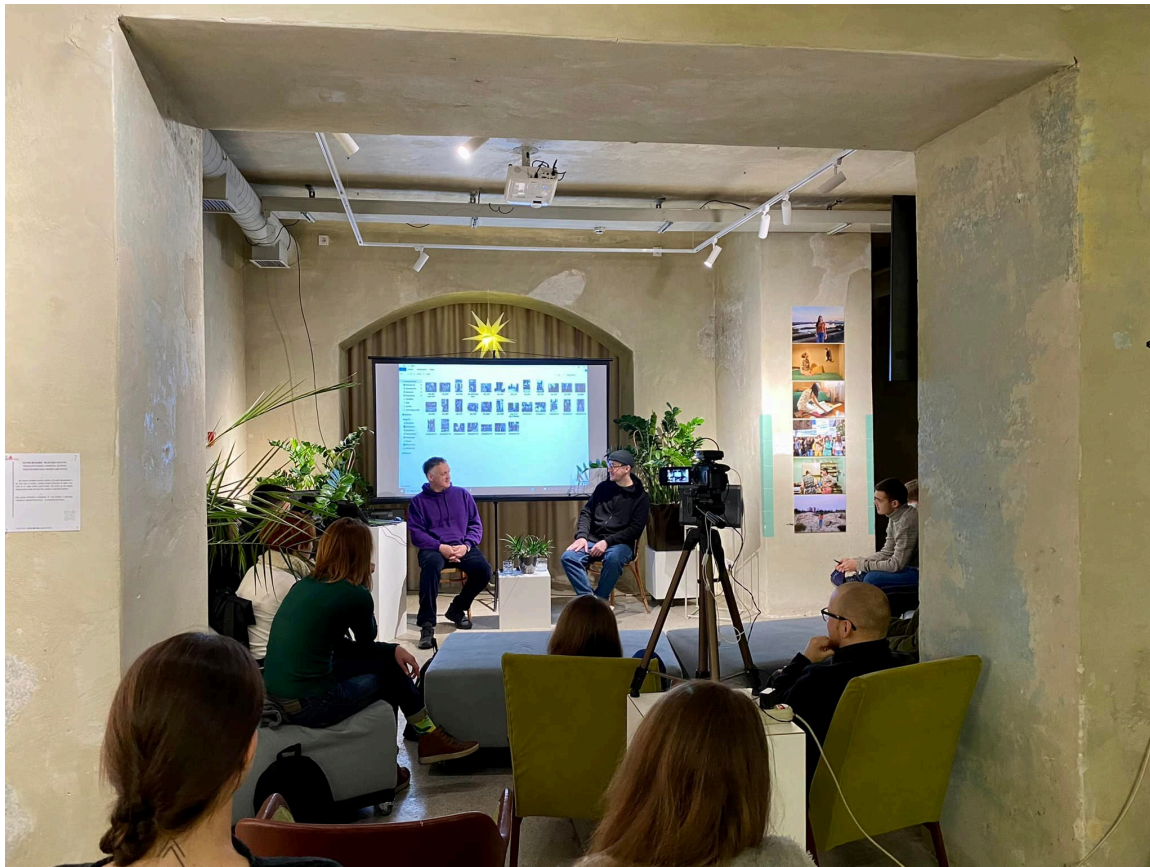
Figure 11. Lviv Municipal Art Center Lecture.

Gothic building dating back to the 19 th century at the periphery of the city center.