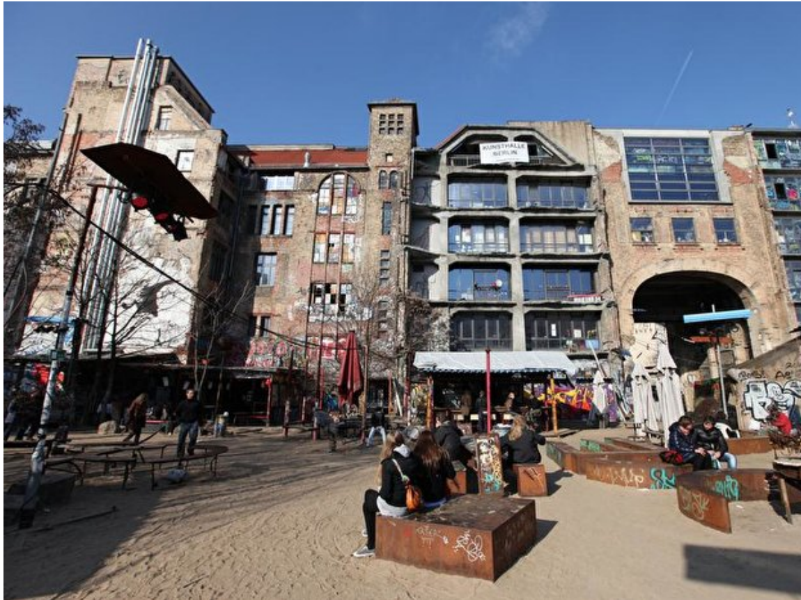
Figure 5. Kunsthaus Tacheles, Berlin.

performed by what groups of individuals and for what purposes, are celebrated.” (Heim LaFrombois 2017, p429).