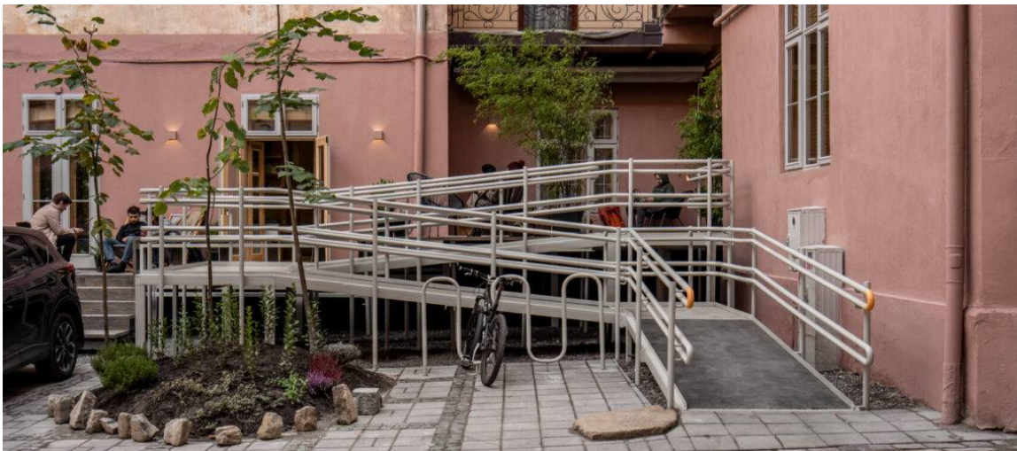
Figure 25. Accessible ramp at Lviv Municipal Art Center.

The main entry to the building is through a passageway that opens to an apartment building, which is a part of the same structure. A café is located in the courtyard with a second entrance to the café. One important design feature is the ramp that allows access to people with disabilities (Figure 25), something that is very rare in Ukraine, especially in historic neighborhoods and buildings. Lyana noted that her team wanted to make this space accessible to all people including those who are deaf, blind or with limited mobility.