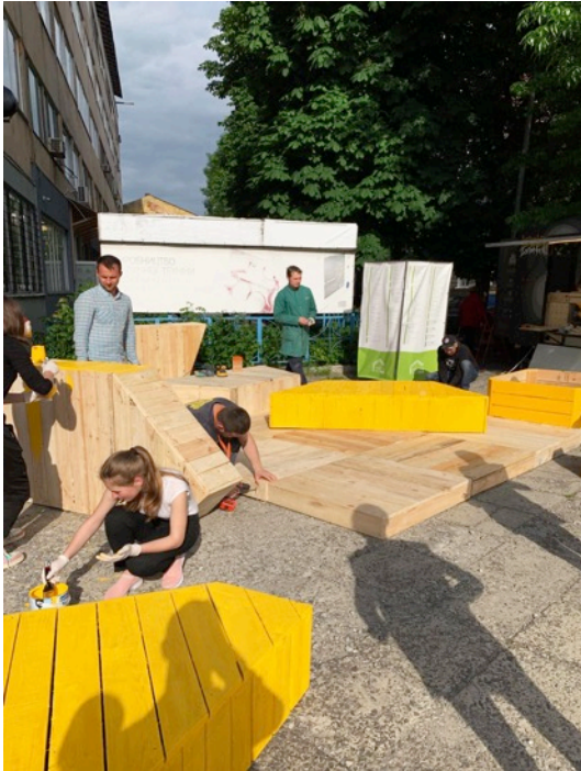
Figure 22 ReZavod Parklet Installation, Photo: ReZavod Facebook

take time for KIVSH to be fully-occupied, so we can see how it transforms and integrates into community once development is complete.