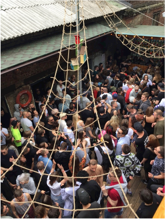
Figure 35. Strichka Festival at Closer.