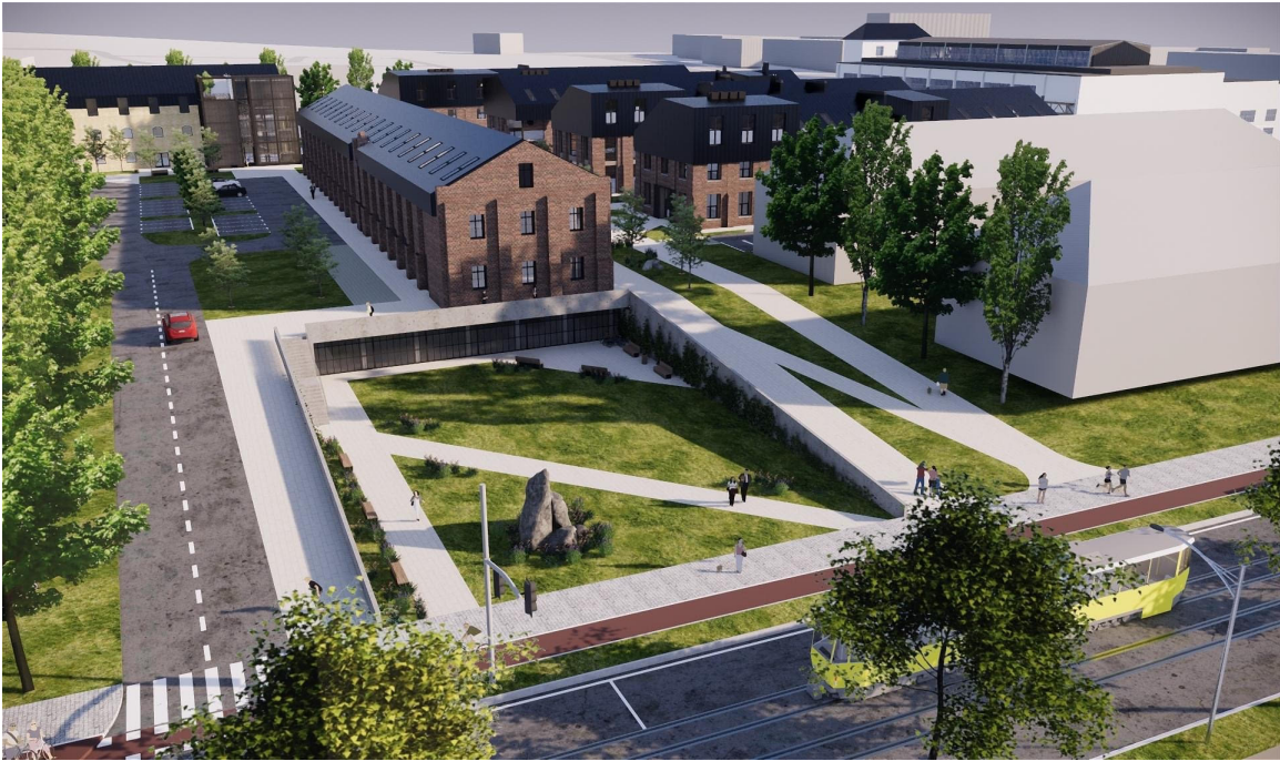
Figure 26. KIVSH Rendering.

During my 2020 visit, KIVSH was predominantly under construction, with only one of the buildings at the entry to its site in use by the KIVSH offices. As indicated in the architectural renderings (Figure 12, 21 & 26), the site is being developed for various uses, which will include outdoor gathering spaces with ample seating, offices devoted to architecture, technology and other creative uses, as well as spaces devoted to educational programs, art, and events for the local community.