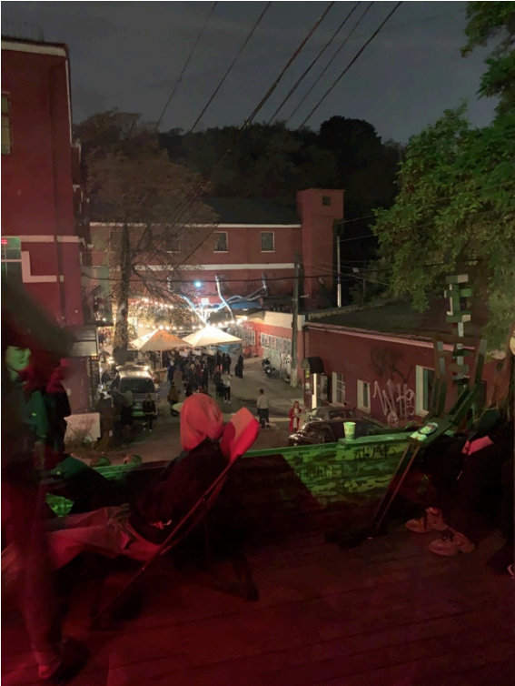
Figure 34. Strichka Festival at Closer.

Each year, Closer holds a three-day international electronic music festival called “Strichka,” the Ukrainian word for ribbon, which is what the factory used to make (Figure 34 & 35). Renowned DJs from all over the world come to perform, and during this part of the summer, Kyiv is filled with tourists. The attention that this festival has brought to Closer is enormous, and it injects visitors into a part of Podil that has previously been neglected. The streets that lead to Closer have more cafes, restaurants and bars that have opened in the last few years. It showcases