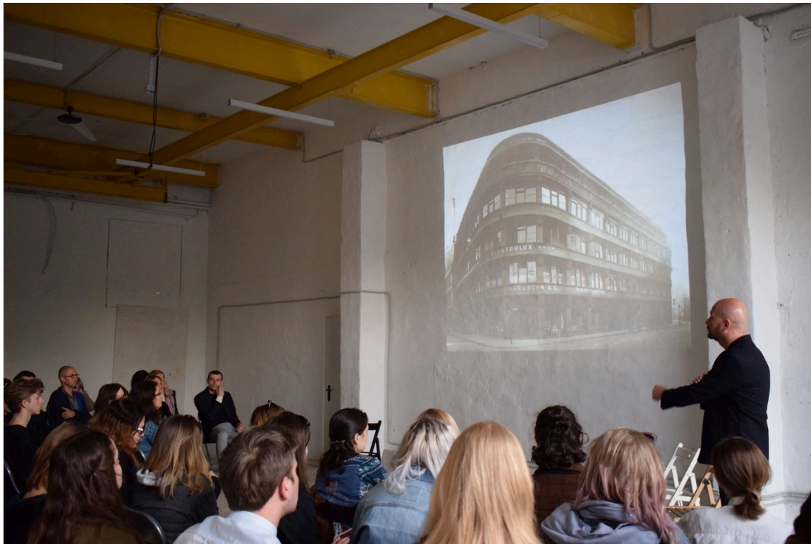
Figure 18. Lecture at KARZ.

architecture, as well as music, art and cultural events (Figure 18).