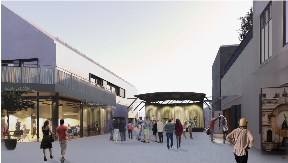
Figure 27. Jam Factory Rendering.

cohesive outdoor space connected by a basement. Once complete, all buildings and outdoor spaces will allow for flexibility in use and ease in movement throughout the project.