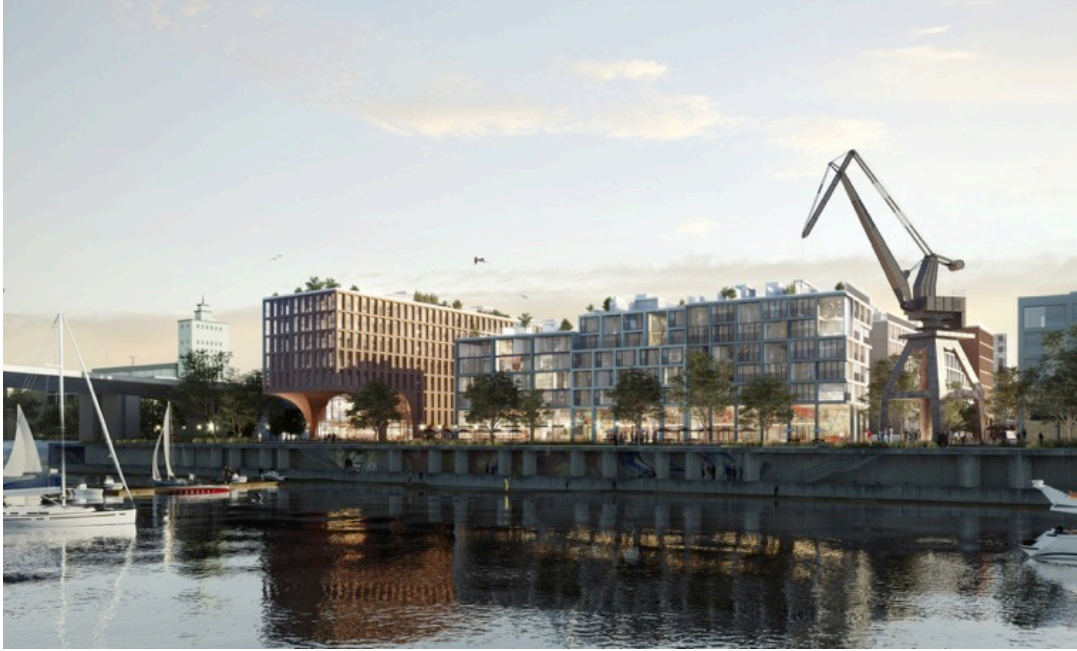
Figure 36. "New Podil" River Port Complex Rendering, Photo: Saga Development