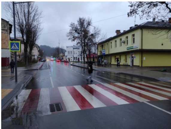
Figure 31. Bohdana Khmel'nyts'koho Street, Photo: Зручне місто

All of these projects show that physical revitalization of formerly neglected neighborhoods is possible as is the utilization of formerly neglected buildings. In both cities, after the fall of the Soviet Union, many factories ceased to exist and industrial neighborhoods became neglected.