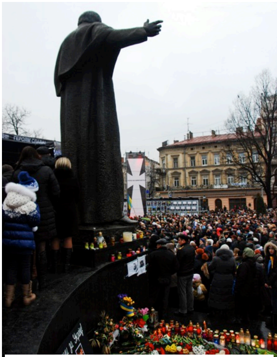
Figure 1. Lviv during Euromaidan, late Feb 2014, Photo: Christina Monzer

November 2013 marked a major shift in Ukraine as protests began following the government's decision to back out of the Association Agreement with Eastern Europe. 2 Masses of citizens flooded Kyiv's central Maidan Square to show their strong desire for change and the removal of the pro-Russian government. By early 2014, tensions escalated as riot police dismantled tents and barricades set up by protesters, resulting in the death of approximately 100 protesters by snipers on February 20, 2014, now known as "The Heavenly Hundred". Concern grew across the country and internationally as the protests continued and Ukrainians mourned the devastating losses (Figure 1 & 2). By late February, then President Viktor Yanukovitch fled the country, and an interim government was formed by the parliament until elections could take place. (Yelchak 2015)