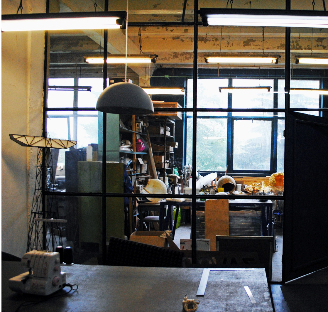
Figure 14. Art Studio at ArtZavod.

the factory, they got many proposals to create other uses of the factory. Eventually, they rented four floors of the building and slowly expanded into other outdoor spaces of the territory, which is quite large.