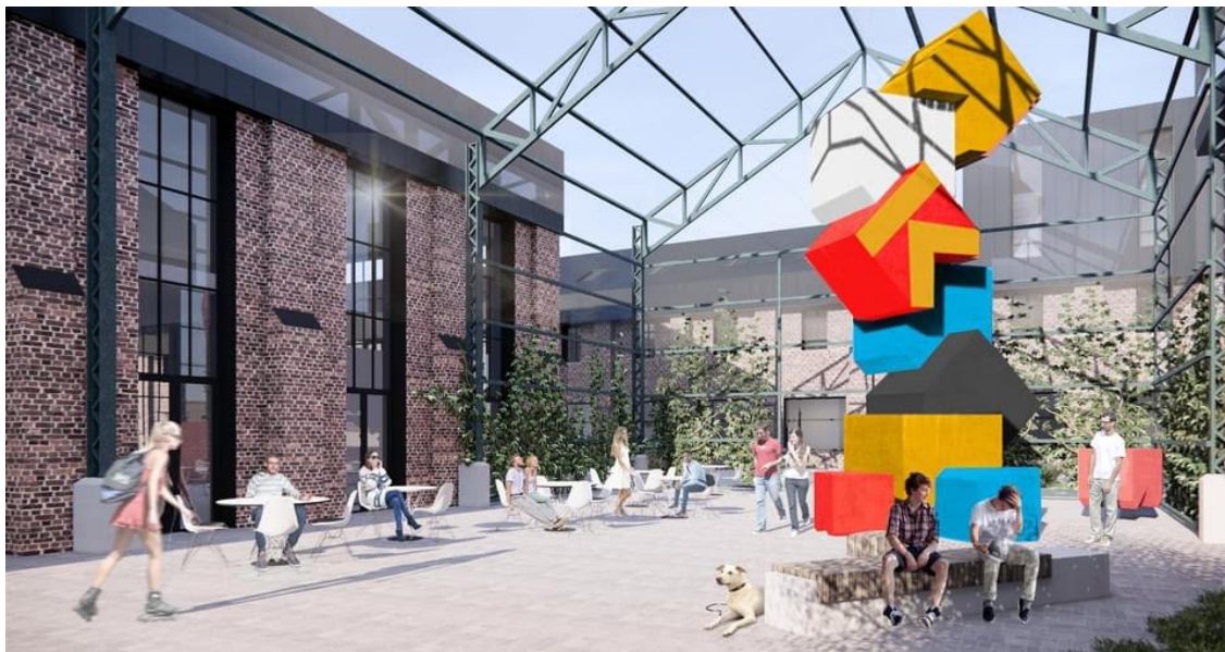
Figure 21. KIVSH Rendering.