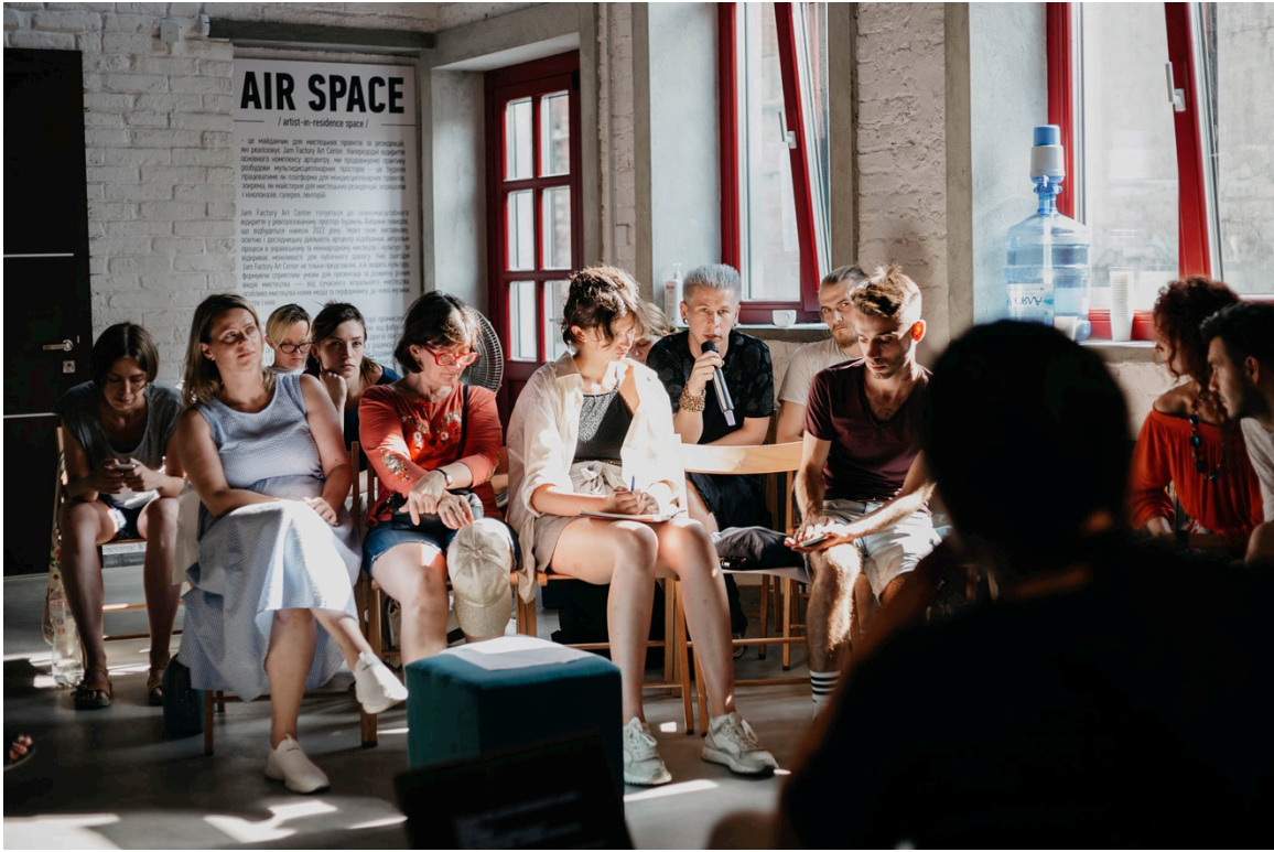
Figure 24. Lecture at Jam Factory’s Air Space.

While the architectural renovation was in process, the Jam Factory team conducted research, built a relationship with the community, and submitted grant proposals for funding. In 2017, they set up a temporary space, called “Air Space” for their offices and to hold events, called “Infopoint,” adjacent to the project site (Figure 24). The development team worked on acquiring funding to develop lecture and exhibition series and art fellowships for artists. They conducted cultural events, art exhibitions and rented out the space to other organizations.