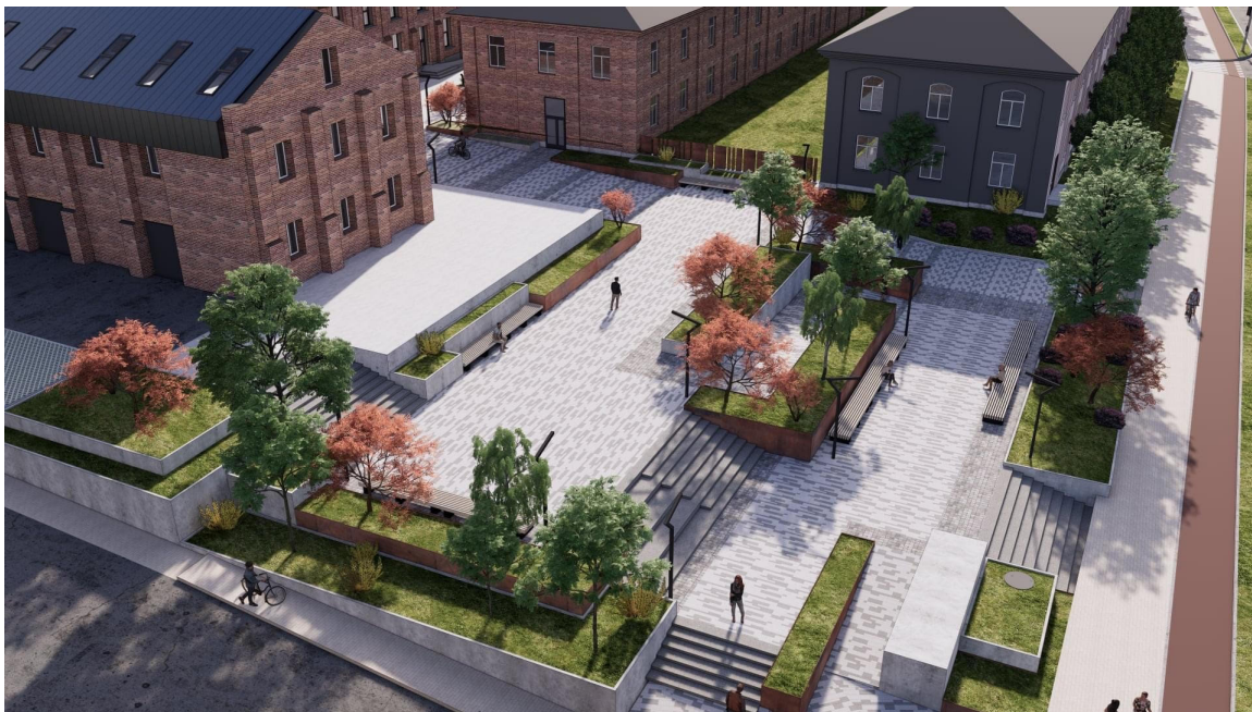
Figure 12. KIVSH Rendering.

art. The gallery is free to the public as are most of the events (a lecture at the center can be seen in Figure 11). The café is in frequent use by the community and is a place for collaboration and dialogue. The center departs from the historic museums of the city that are geared towards tourists. Its mission is to bridge divides between people of different backgrounds.