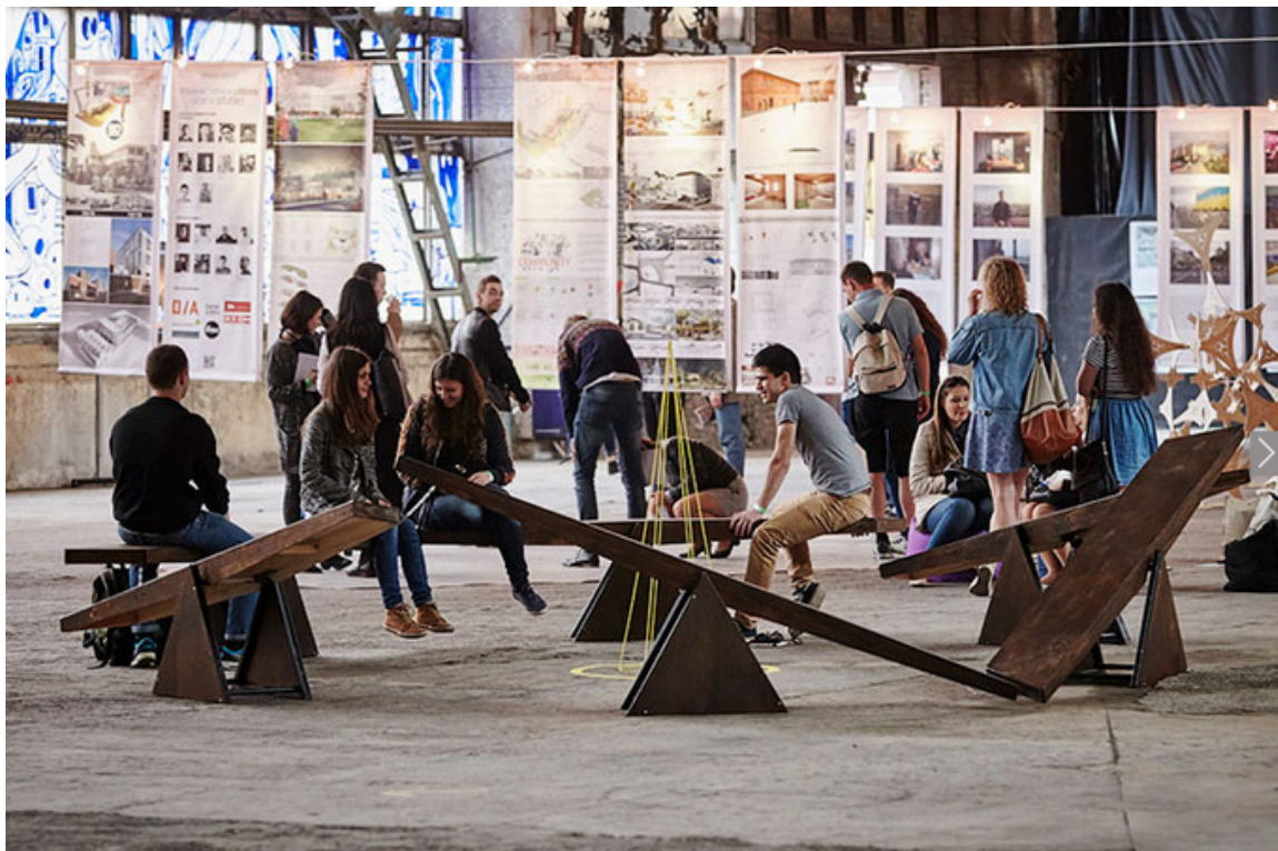
Figure 20. CANactions Architecture Festival.