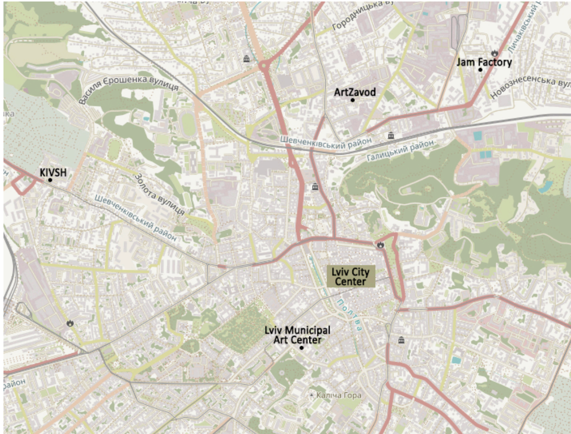
Figure 9, Lviv Cultural Hubs Map