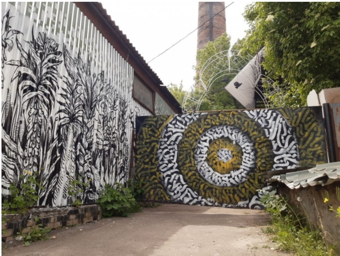
Figure 30. ReZavod Murals.

changed, and predominantly houses old industrial building, a few blocks away the neighborhood is changing with the addition of a new mall. ReZavod exemplifies a desire by a community to employ DIY and transform a space, making it accessible to those that may not have the financial means for traditional business spaces. With the building not in full use, it allowed the founders to start a new project and repurpose the existing site to fit their needs. Artists have been welcomed to decorate many of the walls on the territory (Figure 30).