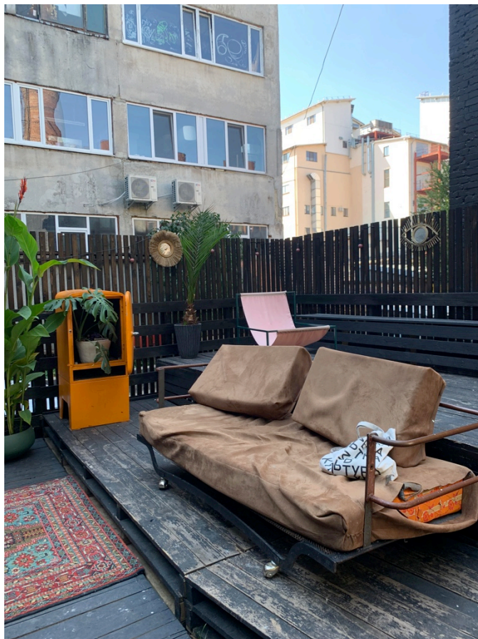
Figure 33. REZavod Courtyard.

The infrastructure in Pidzamche, Lviv is also changing. Bohdana Khmel'nyts'koho Street, which Jam Factory is located on, was been rebuilt in 2020-2021 to include a bike path, clearly marked pedestrian crossings, and accessible bus stops (Figure 31 & 32). This is one step that the Jam Factory team envisioned for the neighborhood in order to create better connections to the rest of the city.