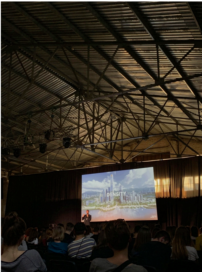
Figure 29. CANactions Architecture Festival at the river port in Podil.

enhancing the access to the Dnieper River in Kyiv, which is very limited. One method that they have utilized to bring attention and access to the riverfront is by hosting their architectural festivals in locations that are unutilized by the public, typically industrial port areas (Figure 29). They have collaborated with the developers, and have been able to bring thousands of people to these areas, many of whom were from Kyiv and had no idea they existed. CANactions School has organized workshops on connecting the riverfront to the greater city with creative ideas and development of proposals, which are showcased at the festivals.