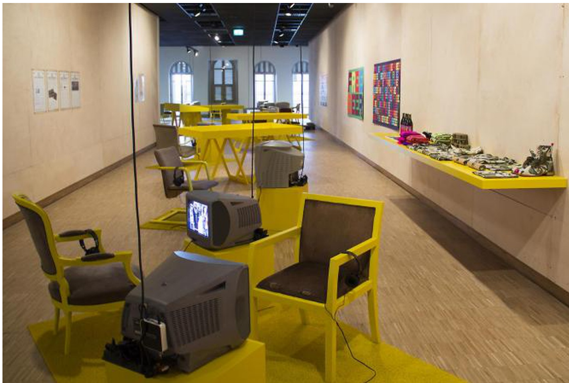
Figure 7. SALT, Istanbul.

Bureau Broedplaatsen , which worked to organize agreements with tenants, while allowing them to utilize spaces for cultural activities on their own. In some cases in Ukraine, city municipalities act in a similar way, especially when it comes to historic buildings, renting them when they are vacant, for cultural initiatives.