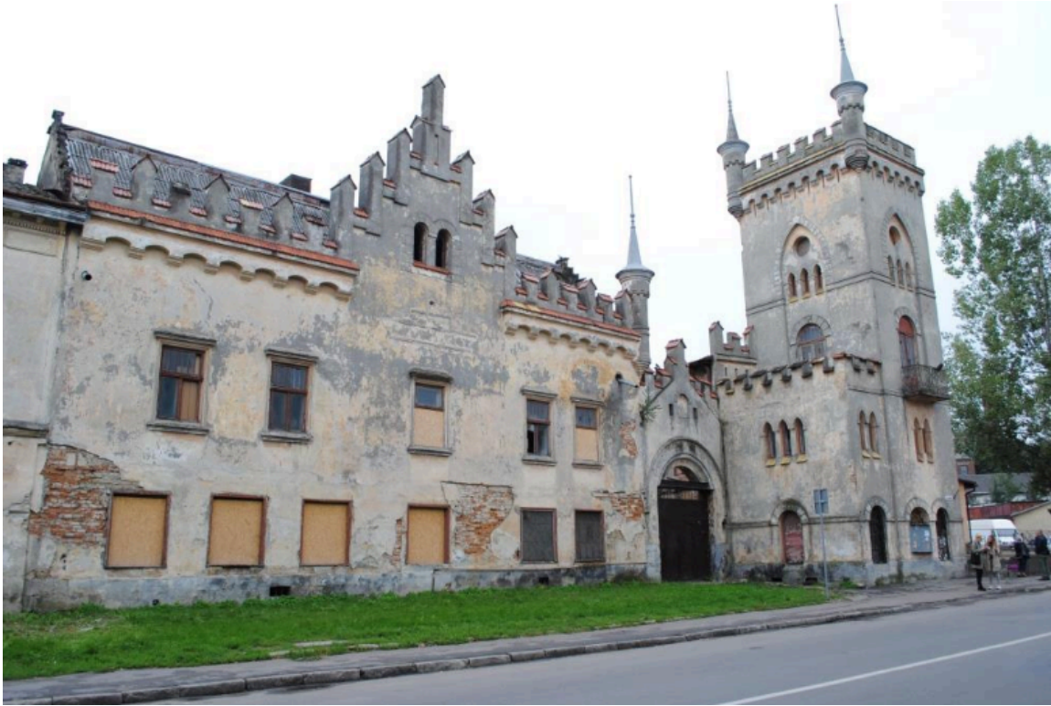
Figure 15. Jam Factory property today.