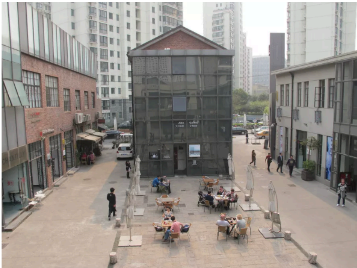
Figure 4. Moganshan Lu, Shanghai.

former oligarch known for his ownership of confectionery factories) to the election of the younger producer and well-known comedian, Volodymyr Zelensky. In Kong's essay, one of her case studies is the Moganshan Lu (Figure 4), located in Shanghai, one of the first mixed use industrial spaces in buildings that were built between the 1930s and 1970s. Originally a cluster of old buildings along the Suzhou River which housed engineering and textile factories, the Moganshan Lu now houses studios (arts, media, fashion and others), galleries and workshops. In the 2000s people set up their studios there because of affordable rent and these activities were the “result not of deliberate planning but natural evolution over time.” (Kong, 2009).