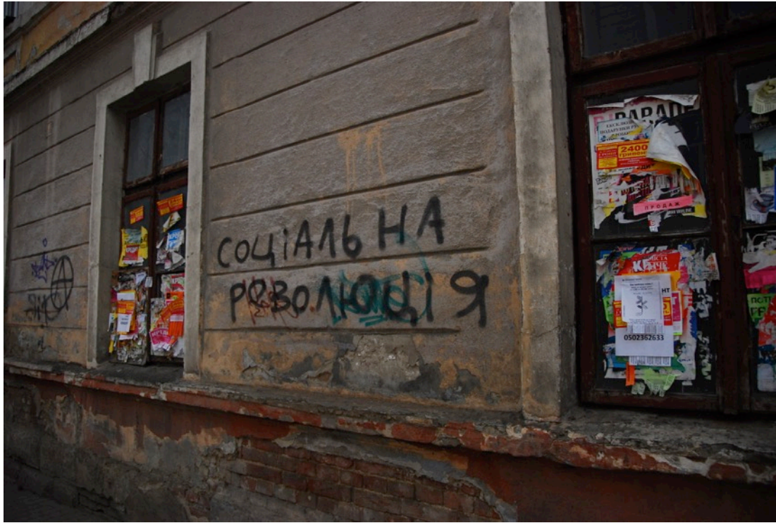
Figure 3. “Social Revolution,” Ukraine, 2014.

learning and creative expression. With this came the development of creative spaces, cultural centers, technology hubs as well as an eclectic restaurant industry in cities across Ukraine.