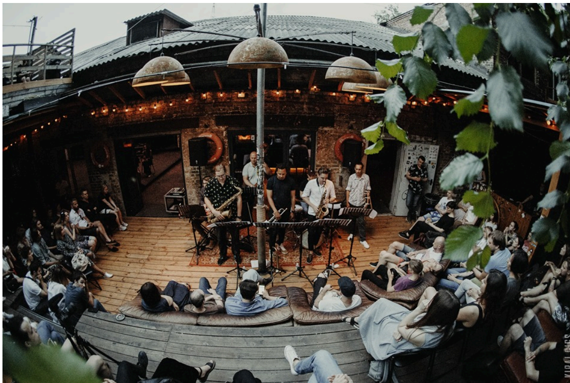
Figure 19. Closer Courtyard, Jazz Festival.

As at ReZavod, there was also a real possibility at KARZ, that as soon as the developer would decide to redevelop the factory, they would be kicked out. Unfortunately, this was the case with this project, which had to close in mid-2021. This example shows that some spaces exist at the whim of private developers in an area. KARZ was able to stay open while the owner of the property was willing to accept low rent for the location, but as neighborhoods such as Podil become desirable to investors, they can quickly destroy small community spaces such as this one.