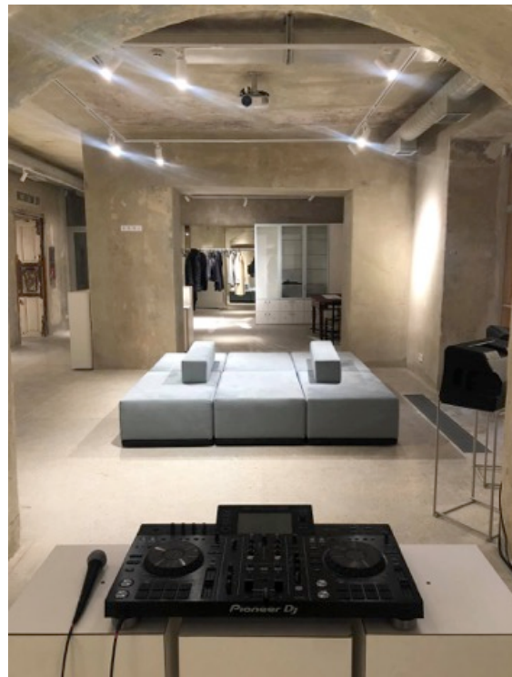
Figure 10. Lviv Municipal Art Center.

In Lviv, the idea for the Lviv Municipal Art