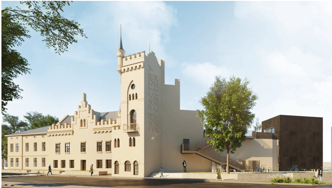
Figure 16. Jam Factory Rendering.

space. A progressive strategy example, the goal of Jam Factory is to become an institution that combines research, education and the creation of art with international and local cooperation. It would also function as an art cluster that would bring in different artists to work together.