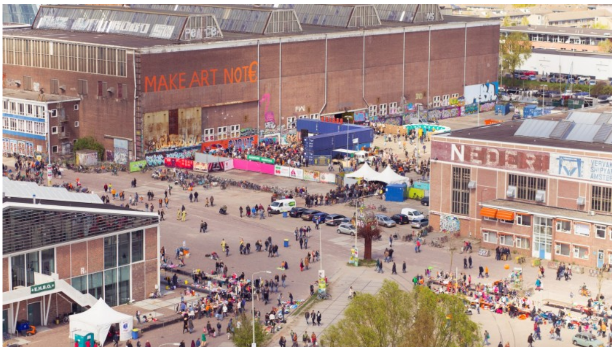
Figure 6. NDSM Wharf, Amsterdam.

the building remained, and artists began to squat in it. The building's transformation represented a "continuous process" led by artists, which resulted in a movie theater, artists' studios and exhibition spaces. The authors also discuss how "likeminded people look for interesting and inexpensive places to organize social, cultural, or professional activities. Accordingly, these groups also reuse and adapt abandoned buildings or sites in pragmatic, user-led, and economical ways." (Plevoets and Sowińska-Heim 2018, p130) While squatting does occur in Ukraine, the examples I use for my research are all largely by communities finding inexpensive ways to utilize spaces.