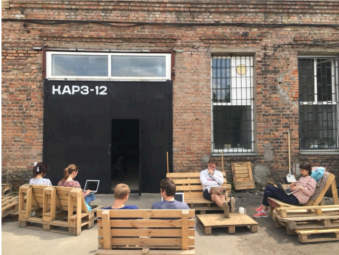
Figure 17. KARZ outdoor space.

KARZ-12 was started as a collaboration between four NGOs - Urban Curators, Agents of Change, (working to create accessible and useful public spaces), A+S (a transport engineering company), and Marichoz (an online platform describing urban activities). They all shared the idea of creating something special for the neighborhood and helping to revitalize it. The developer of the building agreed to share the space with them for free in order for them to bring people to the area and use it for various community and educational activities. The space, which is about 100 square meters, is used for lectures and events connected to urbanism and