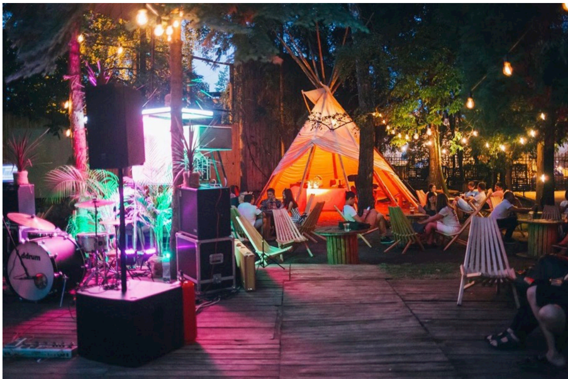
Figure 13, ArtZavod outdoor space.

My next example of the grassroots approach to cultural development in Lviv is ReZavod (also known as Ganok), which is a creative and cultural hub. It is developed in the site of another former factory, just on the outskirts of the Lviv city center in the Pidzamche neighborhood (under the former Lviv high castle). The neighborhood is mostly industrial, so there was not much activity happening around the factory.