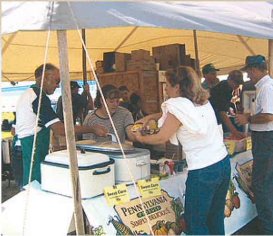
At Pennsylvania State University's Ag Progress Days, Bt sweet corn was offered to consumers alongside corn labeled as "IPM" (grown using integrated pest management), along with informational brochures.

know, are there any foods produced through biotechnology in the supermarket now?" Over the years, "Yes" responses ranged from 33% to 43%. Although this proportion may seem low, given that roughly two-thirds of the items available at food retailers contain GE ingredients, 33% is a fairly high proportion for this type of question relative to other studies (perhaps because of the use of "biotechnology," which refers to a broader range of practices relative to "genetic engineering"). In the 2001 Pew study, only 19% said they had eaten GM foods, 62% said they had not and 19% did not know. When asked how many foods in a typical American grocery store they thought were genetically modified, only 14% of the 2001 Pew respondents thought that over half of the foods contained such ingredients.