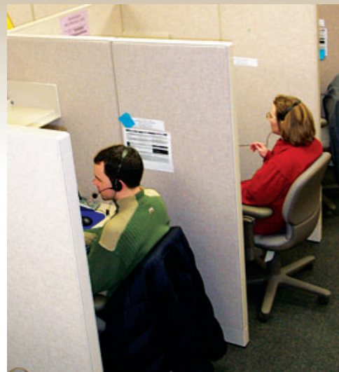
Individual consumer surveys are subject to interpretation, but together they tell a fairly consistent story about attitudes and knowledge of agricultural biotechnology. Above, surveyors question consumers.

Many surveys ask respondents to rate the extent of their knowledge or familiarity with biotechnology or genetic engineering. Two studies conducted in 1998 and 2000 found that only about 20% of respondents said they knew or understood “some” or “a lot” about GM foods (Shanahan et al. 2001). Between 1997 and 2002, several consumer surveys were conducted for the Inter-