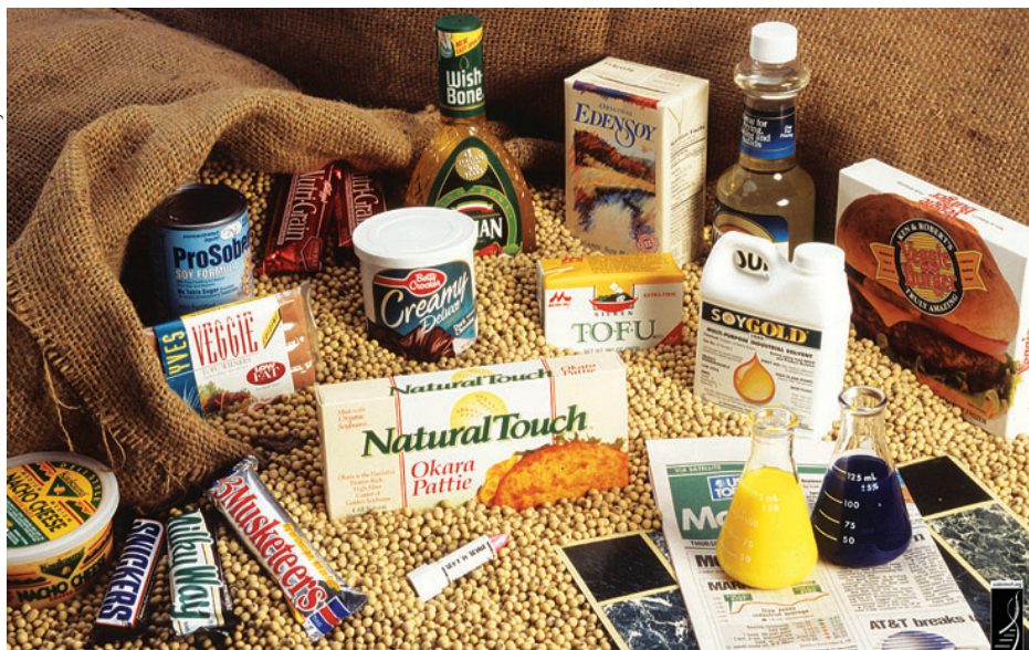
Because genetically engineered cottonseed, canola, corn and soy are common in many processed foods, the percentage of foods in the supermarket with at least one of these ingredients is estimated as high as 75%. But in surveys, many consumers are unaware that they have been eating foods with genetically engineered ingredients.

Other questions ask whether respondents have ever eaten a biotech product, or whether biotech products are available in grocery stores now. The IFIC studies conducted between 1997 and 2003 each asked “as far as you