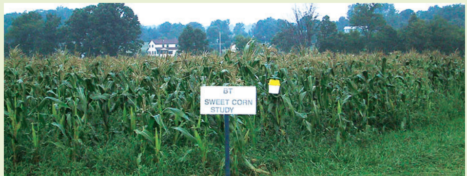
Results from a consumer-preference study in central Pennsylvania suggest that there may be a viable market for Bt sweet corn, above.