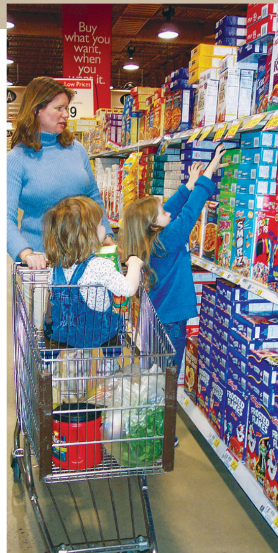
Consumer preferences could play an important role in the future of agricultural biotechnology in the United States.

While market data is not available, a fairly extensive body of survey research has been conducted to assess consumer awareness and knowledge of, and attitudes toward biotech products. Stated attitudes are usually used to infer how consumers might respond to, for instance, food labels indicating