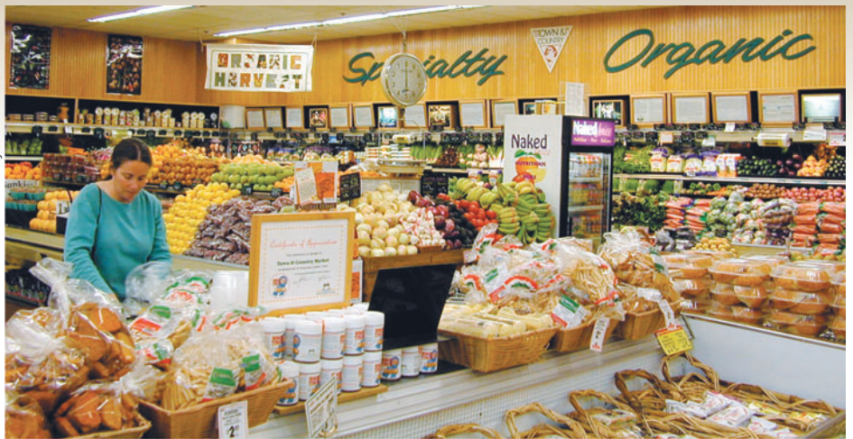
Consumers can avoid biotech ingredients by purchasing certified organic produce and foods, which cannot be grown using biotech crops. It is difficult to determine how important the absence of biotech ingredients is to consumers relative to other components of organic certification.

do not have to commit to actions that are consistent with their stated attitudes or preferences. In contrast, results from experimental auctions, which incorporate purchases, have been shown to more closely approximate how consumers would behave in a market environment. In one type of auction, participants are brought to a common location, given some money and asked to bid on a product. After bids are collected, the "winning" bidders are determined, and they use the money received earlier to purchase the product being auctioned.