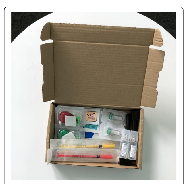
Fig. 2 Street injecting kit – Exchange Supplies (2020)

Harris et al. Harm Reduction Journal (2020) 17:24 Page 10 of 11