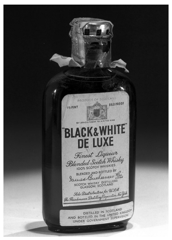
Bottle of bootleg "Black & White De Luxe" Blended Scotch Whisky, circa 1915–20, from the collections of The Henry Ford Museum.