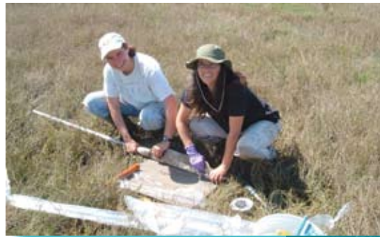
(Left) Taking sediment cores at Petaluma Marsh in San Pablo Bay. (Below) The San Joaquin River in Fresno, California.