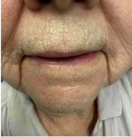
Figure 1. Clinical photograph showing solar elastosis isolated to the perioral region.

long-term sun damage, with the degree of elastosis correlating with the cumulative amount of UV radiation [2]. Heat and chemical-based treatments are also hypothesized to contribute to the development of solar elastosis [3]. Histologically, solar elastosis is characterized by elastic fiber hyperplasia, disorganization, and aggregation in the dermis, increasing the ratio of elastic tissue to collagen and proportionally reflecting the severity of the damage. In the affected dermis, elastotic fibers stain basophilic with hematoxylin and eosin stain, contrasting normal elastotic fibers that stain eosinophilic [1].