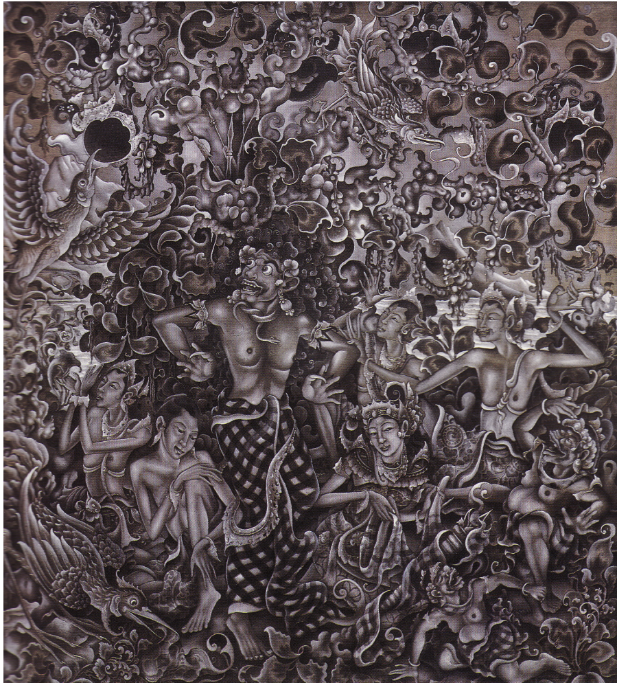
Figure 4: Pandavas in Disguise , Ida Bagus Rai, 1972, acrylic on canvas, 139 x 128 cm. Neka, Suteja, and Garret Kam. The Development of Painting in Bali . Ubud: Yayasan Dharma Seni Museum Neka, 1998, 17.