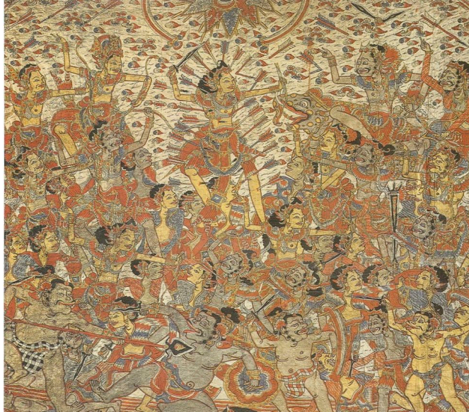
Figure 2: Death of Abhimanyu , artist unknown, late 19 th century, mineral pigments, ink on bark-cloth, 100 x 106 cm. Neka, Suteja, and Garret Kam. The Development of Painting in Bali . Ubud: Yayasan Dharma Seni Museum Neka, 1998, 13.