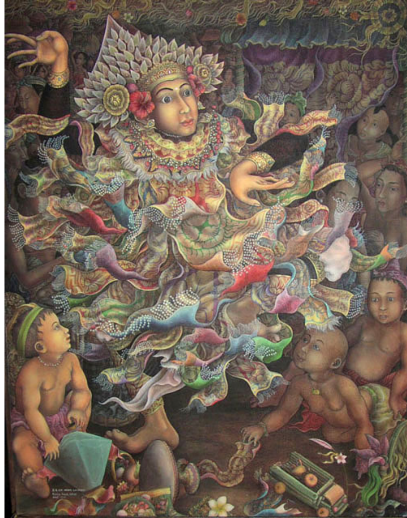
Figure 8: Baris Dance , Anak Agung Gde Anom Sukowati, 1995, acrylic on canvas, 135 x 100 cm.

Puri Lukisan Museum, private collection of Soemantri Widagdo, last accessed June, 25 th 2015: http://museumpurilukisan.com/museum-collection/ubud-painting/anak-agung-gde-anom-sukawati-b-1966/