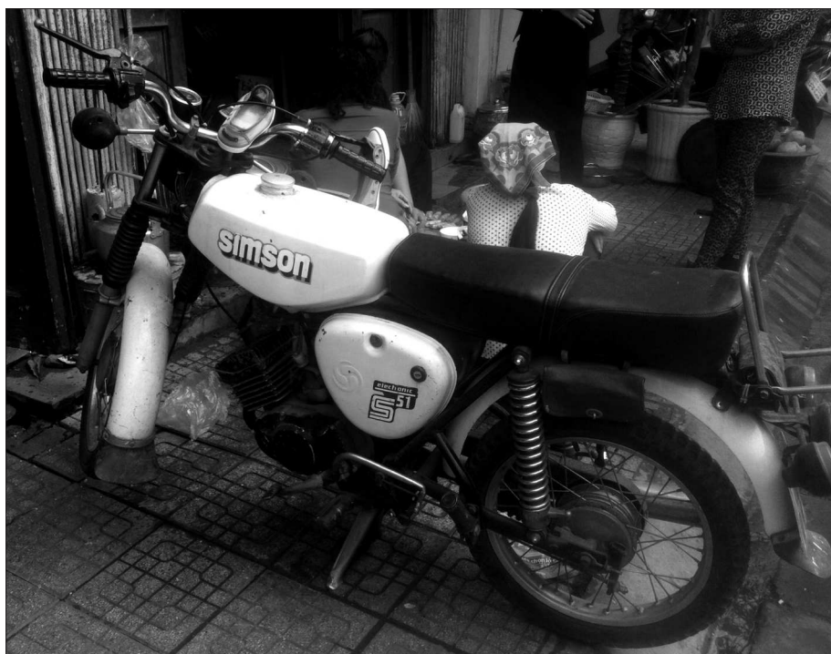
Fig. 1. GDR Simson S51 motorbike, Hanoi, 2014. (Pham Phuong Chi)

nually, the Vietnamese government considers the exportation of labor vital to the project of viable and sustainable nation-building: generating new jobs, increasing both household income and flows of foreign currency, and strengthening relationships with cooperating countries. 2 And while Vietnamese researchers have noted that labor migration outflows have indeed had a “profound impact on the reduction of poverty and unemployment” in Vietnam, 3 the extent to which an export labor system under global capitalism can effectively decrease poverty over the long term, or might only be a temporary panacea, has yet to be determined.