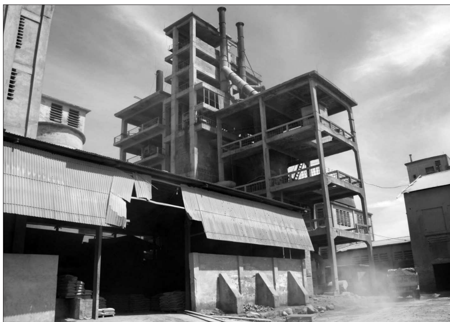
Fig. 2. GDR-rebuilt Cau Duoc Cement Factory, Vinh City, 2012.

GDR, though without undermining the latter's economic and technological superiority. For example, in response to a coffee crisis in East Germany, the two governments signed a cooperation agreement in 1980 whereby the GDR would fund the development and expansion of Vietnamese coffee production in return for the export of raw coffee beans. 28