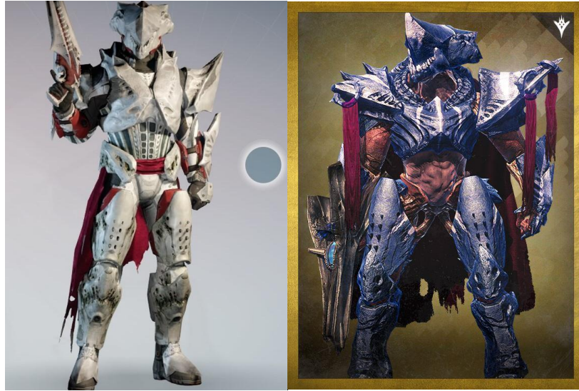
Figure 7: On the left, a Titan Guardian is wearing a full set of Raid Armor. On the right is the War-priest. If successful, a Guardian can wear their enemies.

The acquisition of grotesque armor in Destiny enables a symbolic system of communication that tells a narrative of their progress, effort, and status. According to Springer, the acquisition of grotesque armor represents triumph over the beast and the acquisition of the beast's strength. Grotesque armor, in both literature and history, functions as a trophy that simulates the power of the beast, and most importantly, the wearer's power over the beast. 63 In this way acquisition of Hive armor is similar to Perseus's acquisition of Medusa's head, or Heracles's acquisition of the Nemean Lion's impenetrable skin.