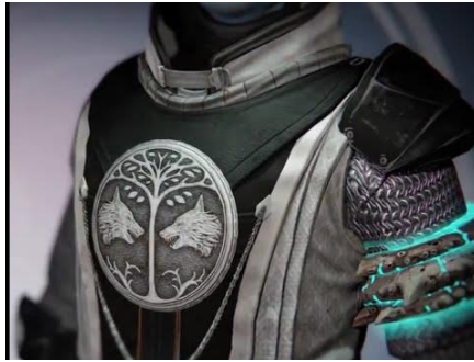
Figure 3: Destiny’s Iron Companion Vestments. Note the Iron Banner heraldic symbol and the chain mail. 48

composed of ring mail, or chain mail, a common armor used between thirteenth and fifteenth centuries. The Iron Companion Vestments show the heraldic insignia of two combatant wolf-heads divided by an eradicated tree. 47