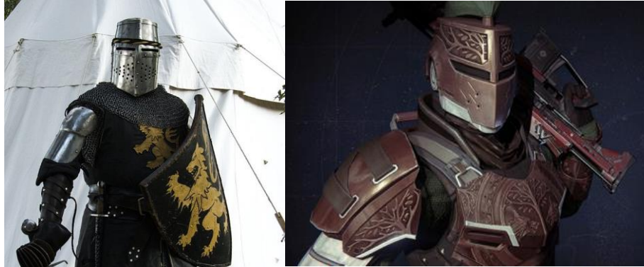
Figure 5: a side by side comparison the Iron Companion Helm with a thirteenth century great helm. 53

“companion” reminds us of how medieval and early modern armors function as companionate prostheses.