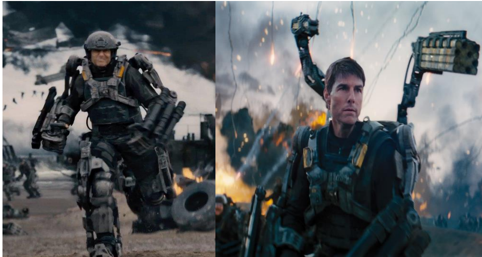
Figure 8: Tom Cruise, as William Cage, wearing New Jacket armor. The picture to the right shows the New Jacket’s “angel wings” that essentially make Cage a four-armed warrior.

and aesthetically, the exoskeleton is more mechanical in design and similar to the first iteration of Iron Man armor created in a cave. As seen in Figure 8, the armor is very much similar in bulk to Stark’s Mark I armor from the first film.