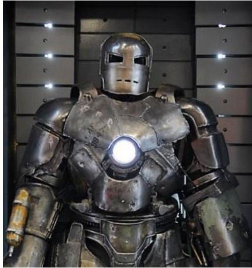
Figure 2: Tony Stark's Mark I Armor created in the confines of a cave. Here, it is reconstructed in Tony's lab. 27

The armor is bulky, moves haphazardly, and is quite fragile. When Tony finally escapes his prison, the armor breaks apart in mid-air. Stark's transformation into a posthuman begins with his prosthetic heart. Stark also ceases to be a billionaire playboy—in his construction of his suit, he is depicted as a gritty blacksmith as the camera takes great care to emphasize the hammer strokes, the fires of the forge, and clang of metal hitting metal. 28 When Stark first dons the armor, he tells Yinsen: “Come over here and button me up .” 29 It is an odd turn of phrase, considering how bulky the armor is, but it speaks to how the prosthetic gets turned on. The armor is worn like clothing, but requires a series of algorithms, uploads, and button presses to begin.