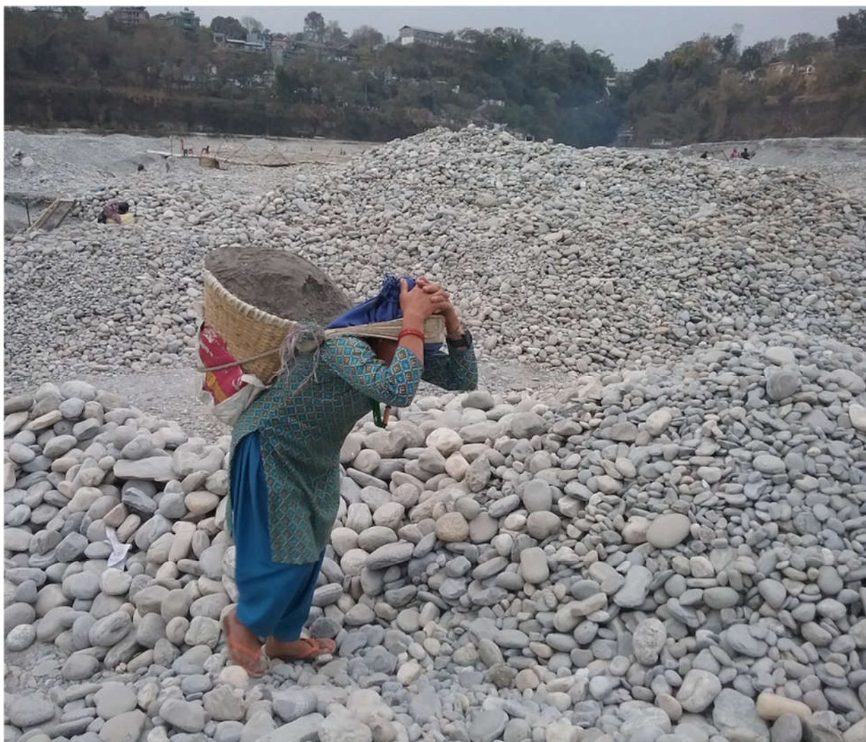
Figure 2. A female sand-miner carrying a load of sand using a doko and namlo at a sand mining site at the Seti River in Pokhara, Kaski district, Nepal, December 2016–January 2017.

Women in Nepal were carrying loads exclusively of sand and stones. Compared to women in Tanzania, women in Nepal carried substantially heavier loads for shorter durations and higher frequencies per week (Table 2). The median loads carried by female sand miners were 65.5 kg (SE: 2.2), and women reported carrying loads a median of 165.5 times per week (SE: 115.9) for less than 1 min per load (SE: 0). Sand-miners in the “high” heavy load-carrying exposure category were characterized by having reported, on average, carrying lighter loads for longer durations/frequencies when compared to those in the “low” exposure category (weight: 69.8 kg (SE: 1.6) versus 57.5 kg (SE: 1.7); frequency: 140.0 loads/week (SE: 343.3) versus 210.0 loads/week (SE: 155.7), respectively).