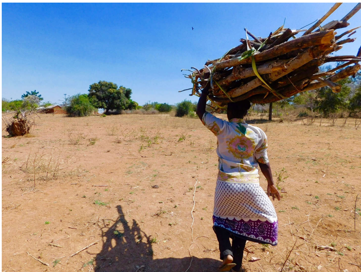
Figure 1. A female carrying a load of wood in Shinyanga region, Tanzania, July–August 2016.

Load-carrying exposures for our participants in Tanzania have been previously reported [21]. Briefly, on the interview date, women were carrying loads of water (n = 51; 62%), wood (n = 17; 21%) or agricultural products (n = 14; 17%). The average weight of all loads measured in Tanzania was 20.0 kg (SE: 0.6): water weighed an average of 20.4 kg (SE: 0.6), wood 21.0 kg (SE: 2.3), and agricultural products 15.9 kg (SE: 1.2). Women reported carrying an average of 3 loads per day in the last 7 days (SE: 0.2), corroborated by information collected using GPS devices from a sub-sample of study participants (n = 14). GPS data revealed an average of 3.6 load-carrying trips per day (range: 1–9 trips), covering an average total distance of 5.32 miles over the course of the 24-h wearing period [21]. Those categorized in the “high” load-carrying exposure index group carried a slightly heavier average load weight, but at a greater frequency compared to those in the “low” index group (weight: 20.0 kg (SE: 0.9) versus 19.2 kg (SE: 0.9); frequency: 33.5 loads/week (SE: 2.3) versus 11 loads/week (SE: 0.9), respectively).