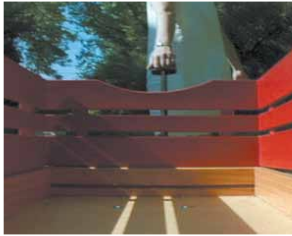
Sasha Waters Freyer, Her Heart is Washed in Water and Then Weighed , 2006

says the word “Julie.” In each of these two films, the filmmaker “misinterprets” language in order to poke fun at the original sources, Perini’s in order to trace the life of a name and Downing’s in order to show how seemingly nonsexual sounds and images can be transformed by the written word. Nada Gordon’s The Garden of Life (2009) also uses subtitles (she and Downing are both part of the Flarf Collective) but focuses primarily on images of women from across the world dancing for the camera. She and Perini both make appropriation films through the method of “collecting” certain kinds of footage in order to reveal particular (gendered) tendencies.