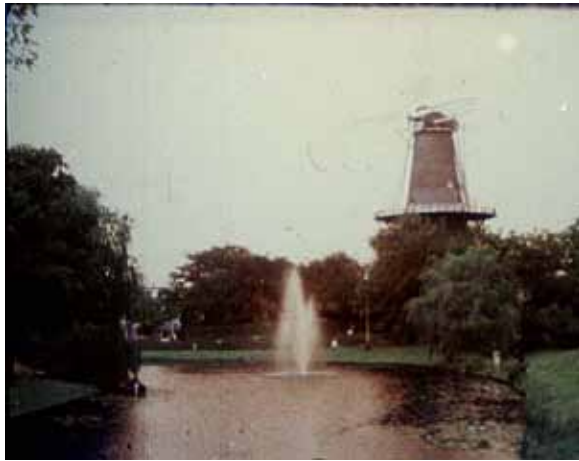
Agnes Moon, Dream of Me , 2007

says the word “Julie.” In each of these two films, the filmmaker “misinterprets” language in order to poke fun at the original sources, Perini’s in order to trace the life of a name and Downing’s in order to show how seemingly nonsexual sounds and images can be transformed by the written word. Nada Gordon’s The Garden of Life (2009) also uses subtitles (she and Downing are both part of the Flarf Collective) but focuses primarily on images of women from across the world dancing for the camera. She and Perini both make appropriation films through the method of “collecting” certain kinds of footage in order to reveal particular (gendered) tendencies.