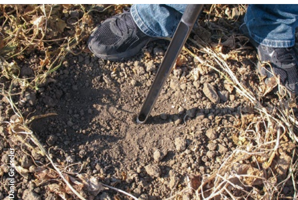
Residue on the soil surface needs to be removed before the soil sample is taken.