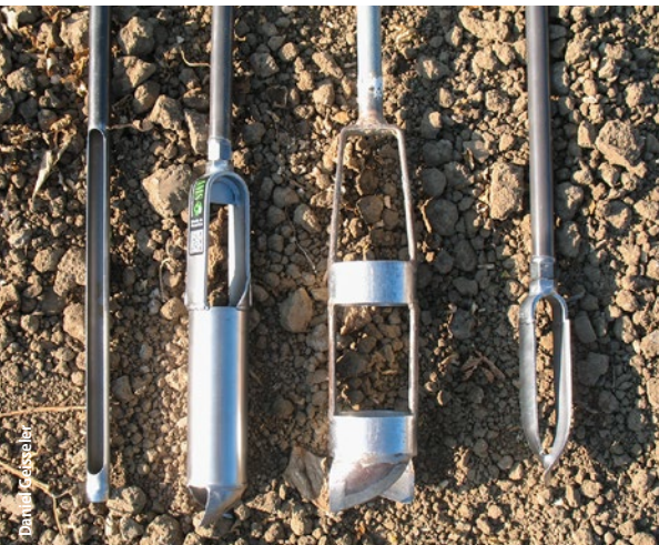
Different tools are available for soil sampling, including (left to right) soil probe, closed bucket auger, open bucket auger and Dutch auger. Under most conditions, the standard soil probe is the best option for most alluvial cultivated soils. Bucket augers work well in stony soils. Open bucket augers are useful in wet clay rich soils. Dutch and Edelman augers may be a better choice than soil probes in stony soils and soils where woody roots are present.

Plant tissue tests do not detect excess soil P supplies (Mallarino 1995; Mallarino