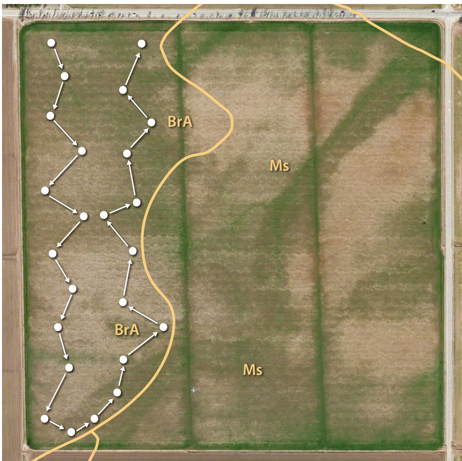
Fig. 2. Soil sampling plan to obtain a representative sample from a field or management area. The sampling points are shown on a Google map using the SoilWeb application (available at casoilresource.lawr.ucdavis.edu/soilweb/ ). The two soil series, Brentwood silty clay (BrA) and Myers clay (MS), are best sampled separately.

Depending on the distribution of nutrients in the soil profile and rooting depth, crops may take up a considerable proportion of nutrients from the soil below the sampled layer. Winter wheat, for example, has been found in one study to acquire 50% of its K from the subsoil (Kuhlmann