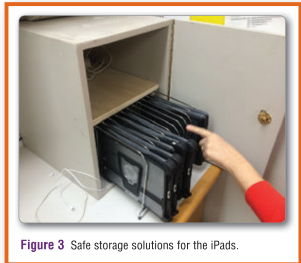
Figure 3 Safe storage solutions for the iPads.

The patient risk for cross-contamination from shared iPad use was addressed in 3 ways: (1) requesting protocols