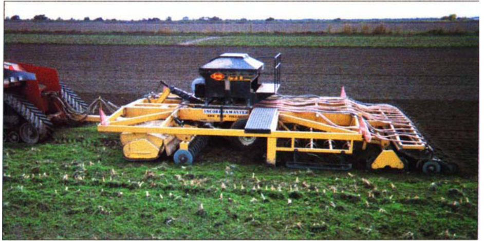
Fuel savings with a new one-pass tillage machine, above, were an average of 50% better than with the conventional method tested. Time savings ranged from 67% to 83%, and soil aggregate sizes after tillage did not differ.