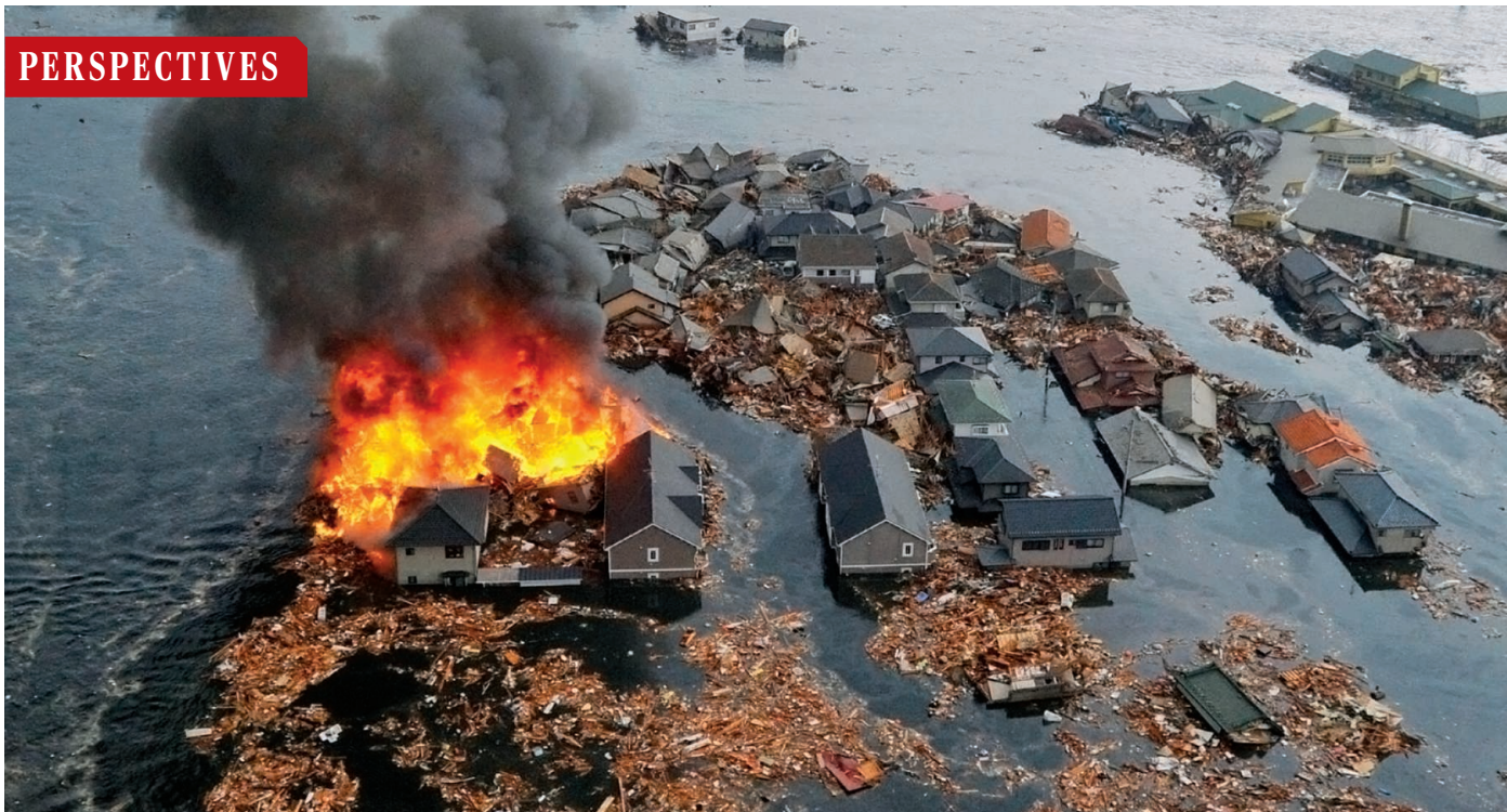
Megathrust aftermath. Tsunami produced by the 2011 magnitude 9 Tohoku subduction earthquake.