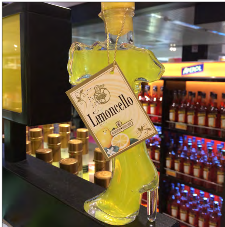
Figure 1. A bottle of Italian limoncello in the shape of the country. Photo by the author, 2014.

Repetitive educational and commercial practices are crucial to the project of successfully familiarizing national subjects with the logomap, and this is especially true for recently created nations that seek to project an organic, transhistorical identity. 2 In the 1920s, school exercise books in the Republic of Ireland (then the “Irish Free State”) had maps of the country on the cover, as an everyday reminder of the shape of the nation (MacLaughlin 2001). The national map has also been a constant and central feature of Turkish political culture since the establishment of the republic in 1923 (Batuman 2010, 220). Detached from the field of official cartography and reproduced as a pop-culture image, the Turkish map has become “open to a new iconographic field through the new signs and symbols attached to it” (Batuman 2010, 222).