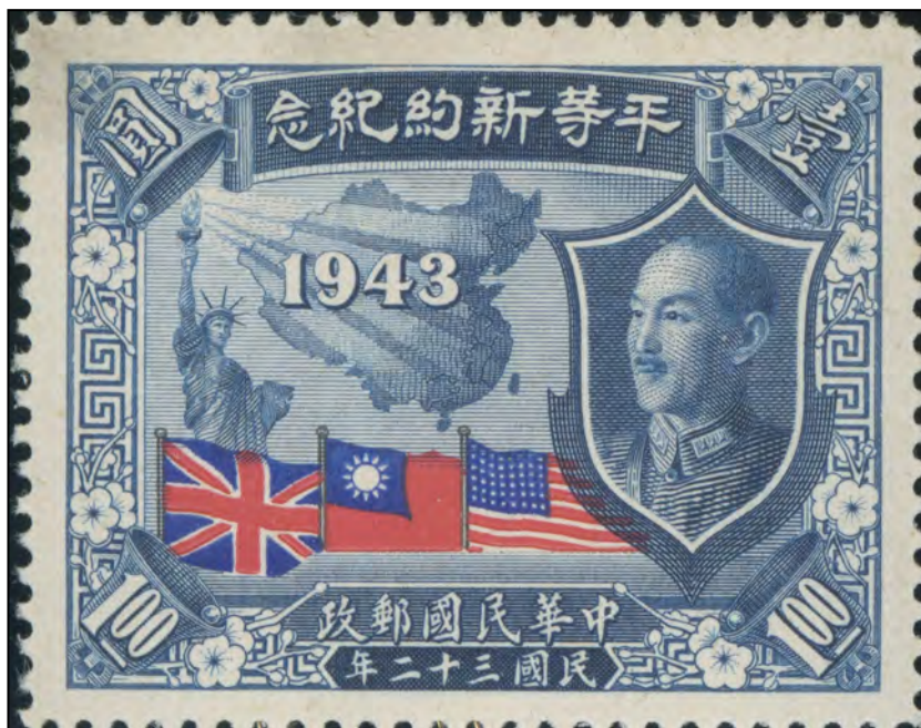
Figure 2. Stamp produced to celebrate the “Treaty for Relinquishment of Extraterritorial Rights in China,” a bilateral treaty signed by the ROC with the United States and the United Kingdom on January 11, 1943.

assurance, China may decide to revisit its past territorial agreements with its northern neighbors. I want to suggest, however, that these anxieties are not reducible to current economic and geopolitical trends. They are also found in cultural misalignments and, specifically, in China's cartographic and lexical practices. The fact that these anxieties precede China's rise by several decades and that they have surfaced recurrently, even at times when China was in a position of weakness, suggests as much.