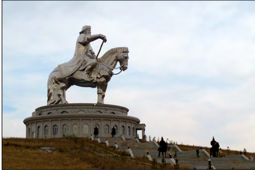
Figure 3. The Genghis Khan Equestrian Statue, 34 miles east of the capital, Ulaanbaatar.