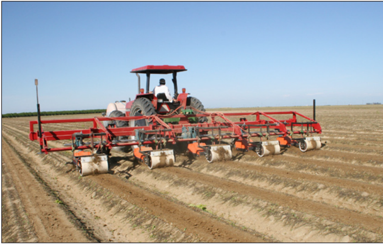
Figure 9. Five-row rotary strip-tiller tilling center of processing tomato beds prior to transplanting, Firebaugh, California, 2006.