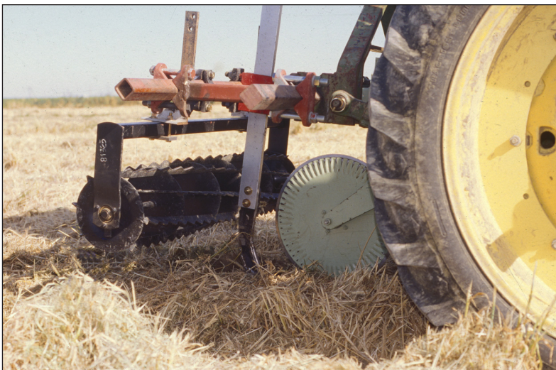
Figure 3. Basic components of early prototype strip-till implement used in California, including residue-cutting coulter, subsoiler shank, and clod-busting rolling basket, Five Points, California, 1996.

and variations on the strip-till tomato theme with both rotary-powered and ground-driven strip-tillage equipment have been made in recent years.