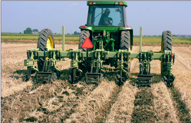
Figure 4. Ground-driven modified Orthman 1-tRIPr strip-tiller implement tilling in cover crop in center of tomato beds and sweeping out furrows for irrigation, Davis, California, 2006.