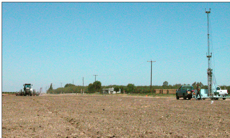
Figure 5. Downwind sampling of PM10 at Burrell, California, dairy, 2003.