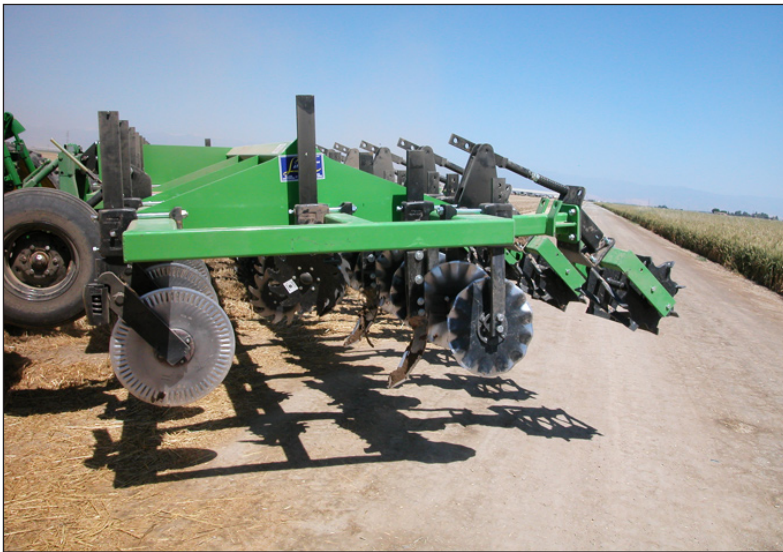
Figure 10. Bigham Brothers Terratill strip-tiller implement, showing residue-cutting coulters, subsoiling shanks, and clod-busting baskets.

uniform in nitrogen content, is less odiferous, has less viable weed seed, and will be mixed more efficaciously into the surface soil with the strip-tiller. Spreading raw manure can leave large clumps on the soil surface that can present problems for seeding, in addition to adding large amounts of weed seed. Local air quality regulations governing manure applications may also apply.