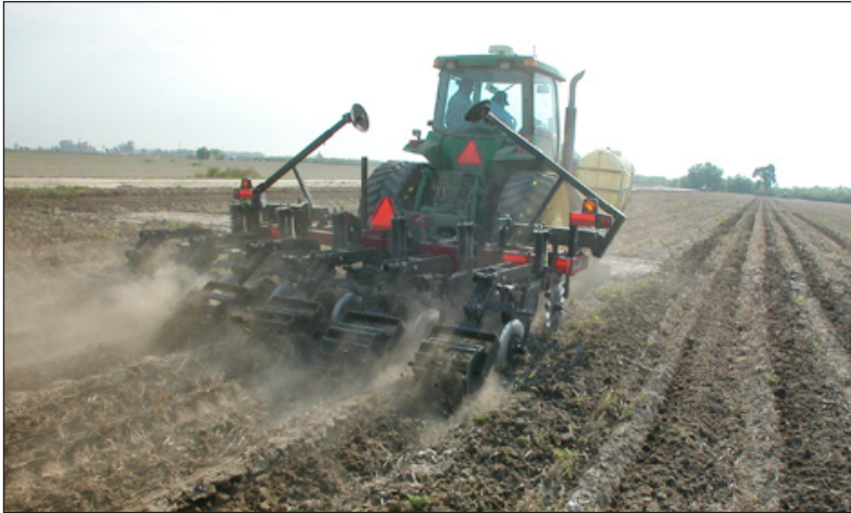
Figure 1. Strip-tilling into barley cover crop before cotton planting, Riverdale, California, 2001.