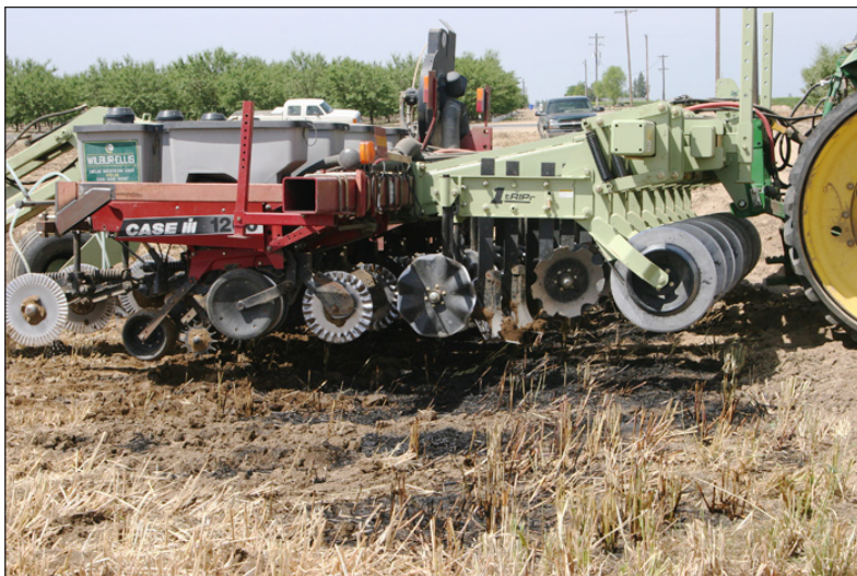
Figure 6. Orthman 1 tRIPr strip-tiller hooked up with planter for "one-pass" strip-tilling and planting, Kerman, California, 2006.

to planting winter forage, or for fall tillage prior to spring-planted crops such as cotton or tomatoes. With recently implemented waste discharge regulations that limit field applications of dairy waste nutrients to 140 to 165 percent of expected crop removal (see CVRWQCB 2007), triple-cropping of forages may become an important cropping system for dairies with limited forage production acreage. This system permits the production of more forage on the same acreage in a given time. Shortened intervals between crops also facilitates the capture of nitrogen before it becomes subject to leaching.