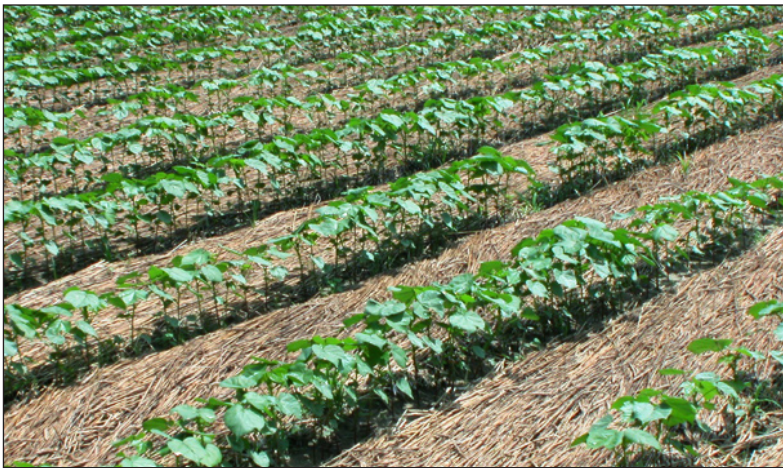
Figure 2. Strip-tillage cotton in rolled rye cover crop, Auburn, Alabama, 2004.