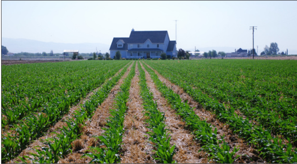
Figure 7. Strip-tilled forage corn stand, Frank Gwerder Dairy, Modesto, California, 2007.

At ten San Joaquin Valley farms in 2007, we compared stand establishment following strip-tillage with plant stands achieved with traditional tillage (fig. 7). Forage corn producers using strip-tillage tend to seek populations of between 28,000 and 36,000 plants per acre. While there were slight differences in stands achieved in strip-tilled fields relative to traditional tilled fields, particularly at a site in Turlock where strip-tilling was done before preirrigating and at a site in Hanford where a higher seeding rate was used in the traditional till field, generally adequate stands have been achieved using strip-till.