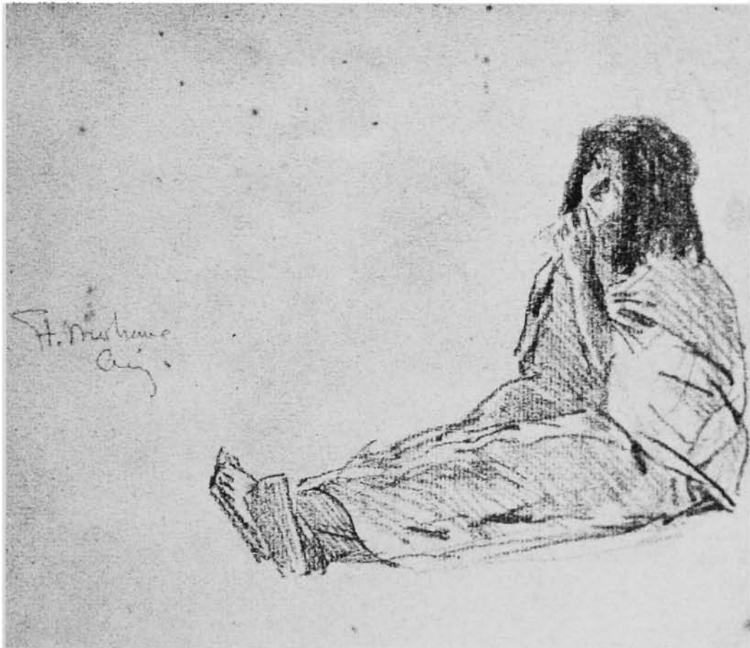
Woman resting (Ft. Mohave, 1900; 19 x 23.5 cm.).