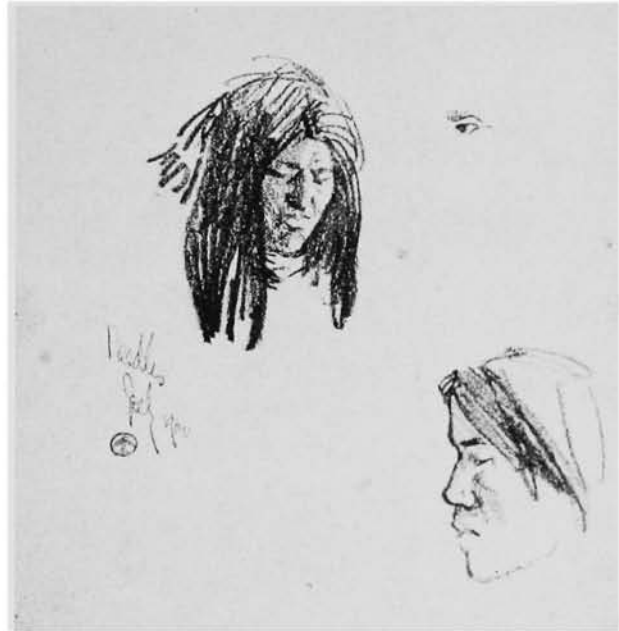
Two heads (Needles, California, 1900; 16 x 14 cm.).