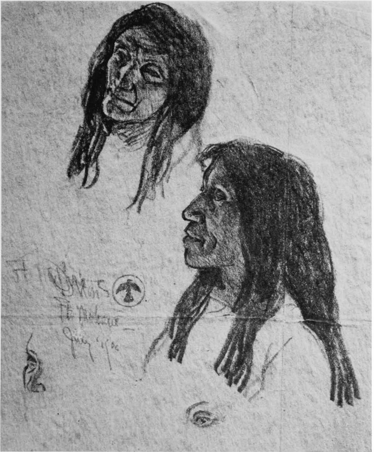
"Two heads" (Ft. Mohave, 1900; 21 x 18 cm.).