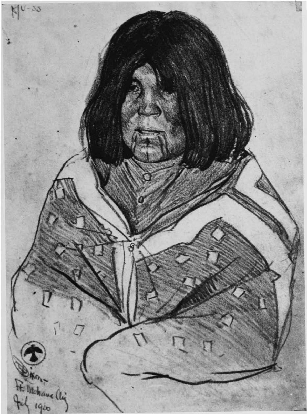
Mú-ss (Ft. Mohave, 1900; 28 x 20 cm.).