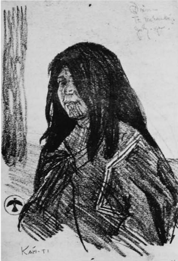
Kám-ti (Ft. Mohave, 1900; 20 x 13 cm.).