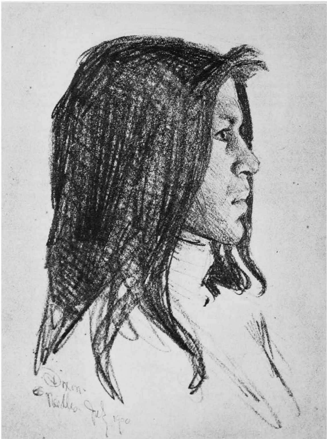
Young woman (Needles, California, 1900; 31 x 23 cm.).