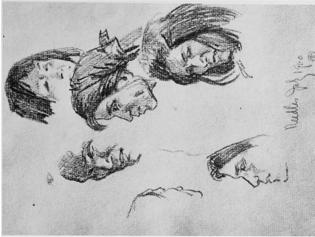
Five Indian head types (Needles, California, 1900; 22 x 16 cm.).