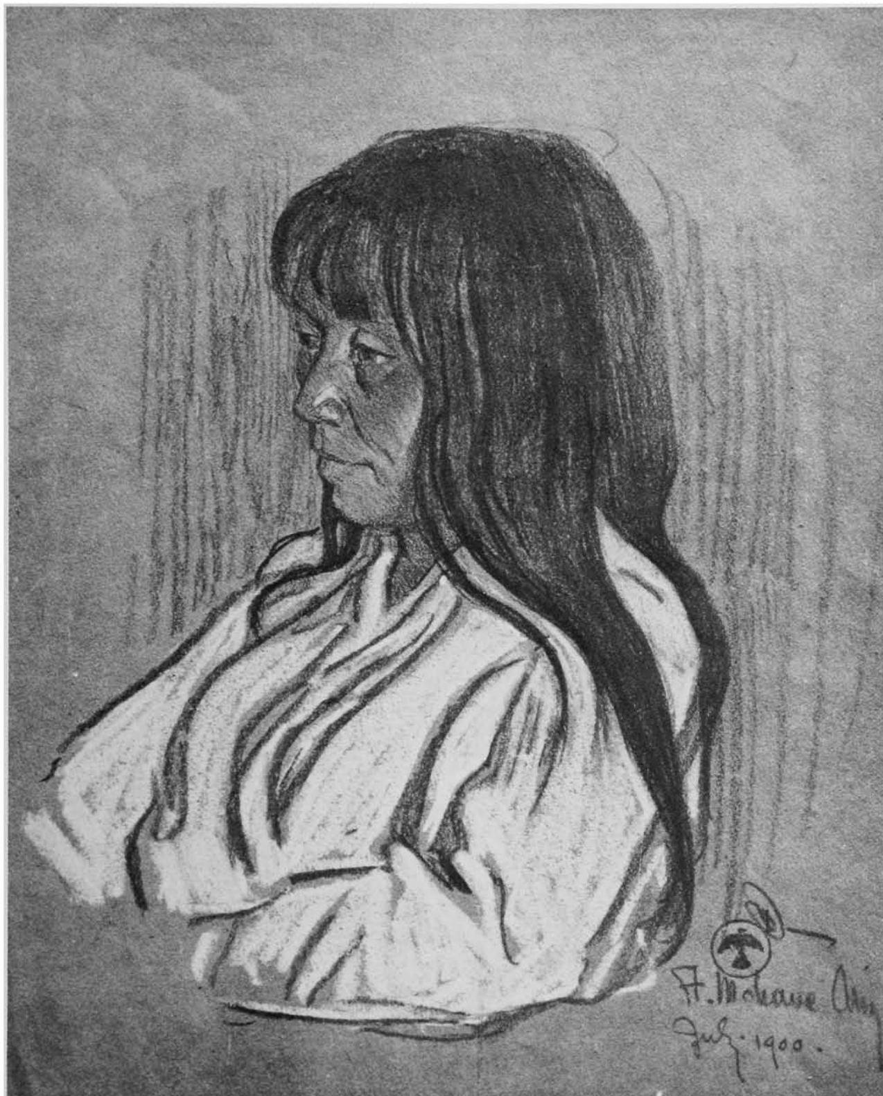
Woman, unnamed, with little or no traces of tattooing on chin (Ft. Mohave, 1900; 32 x 24 cm.).