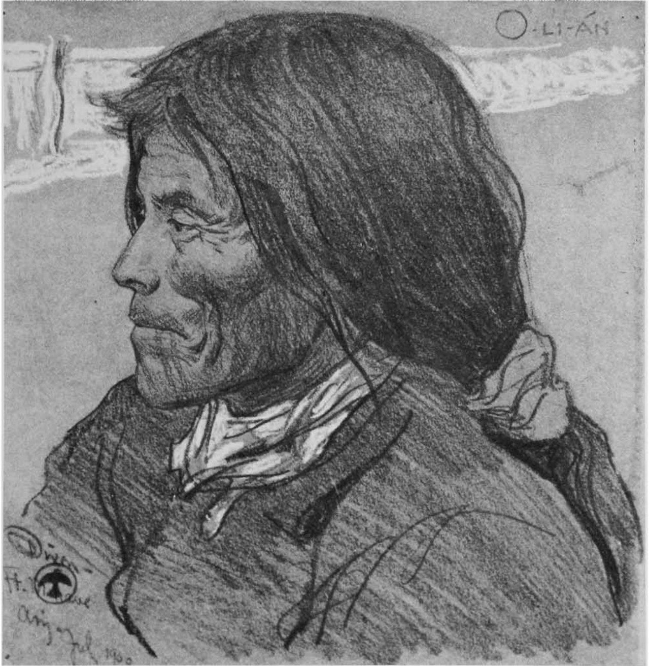
O-li-án (Ft. Mohave, 1900; 26 x 24 cm.).