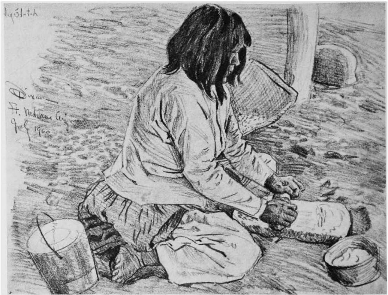
Ny-ól-t-h, grinding maize. Note metal pail at side (Ft. Mohave, 1900; 28 x 20 cm.).