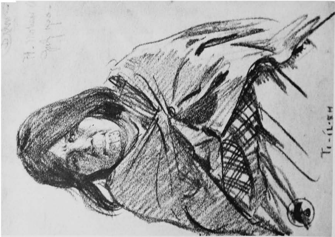
Ti-fl-eh (Ft. Mohave, 1900; 19 x 13 cm.).