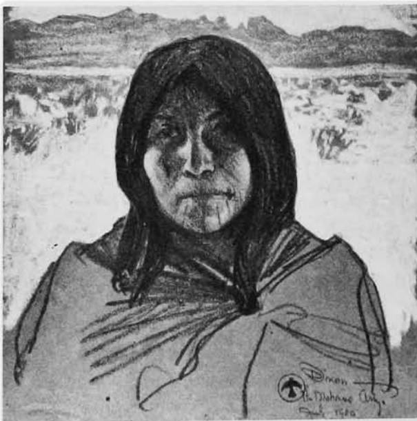
Tattooed woman, unnamed. Note that most women in portraits shown here have chin tattooing. (Ft. Mohave, 1900; 24 x 24 cm.).