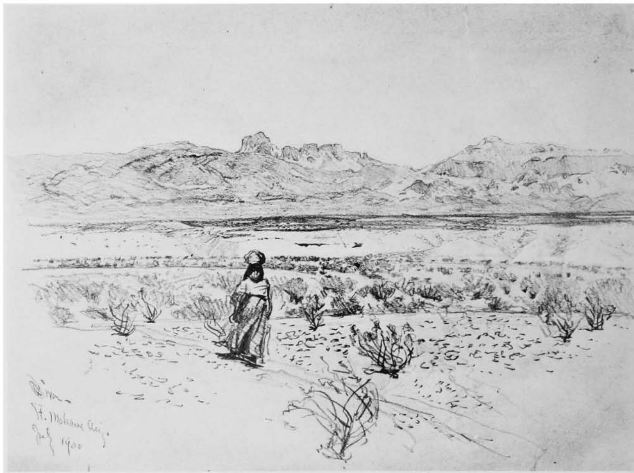
Woman coming to traders. Head load is carried in blanket tied by four corners. (Near Ft. Mohave, 1900; 20 x 28 cm.).