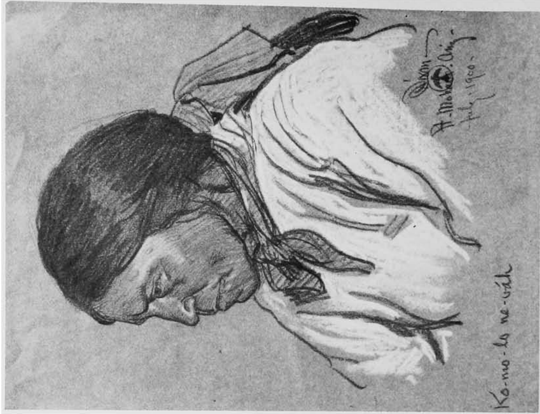
Ko-mo-lo-ne-vák (Ft. Mohave, 1900; 33 x 24 cm.).