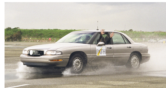
No hands vehicle test - photo courtesy of PATH Staff

During this initial period from about 1988 to 1993, PATH was the only research group in the U.S. that was focusing so much attention on automation. This placed PATH into a unique position when FHWA started to create a national program of research on automated highway systems in response to the Congressional mandate in the 1992 Intermodal Surface Transportation Efficiency Act (ISTEA), which stated: "...the Secretary [of Transportation] shall develop an automated highway and vehicle prototype from which future fully automated intelligent vehicle-highway systems can be developed....The goal of this program is to have the first fully automated roadway or an automated test track in operation by 1997."