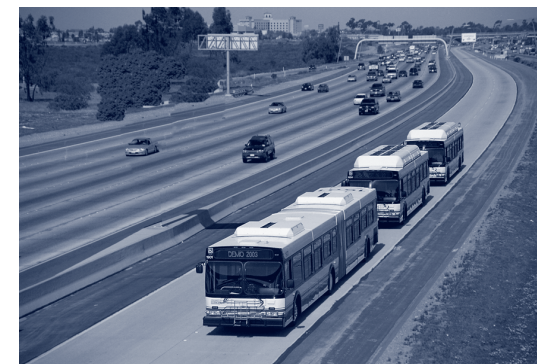
Automated Bus Demonstration 2003

The return of the U.S. DOT to sponsorship of automation research began with the initial Broad Agency Announcement for the FHWA Exploratory Advanced Research Program (EARP) in 2007, under which PATH