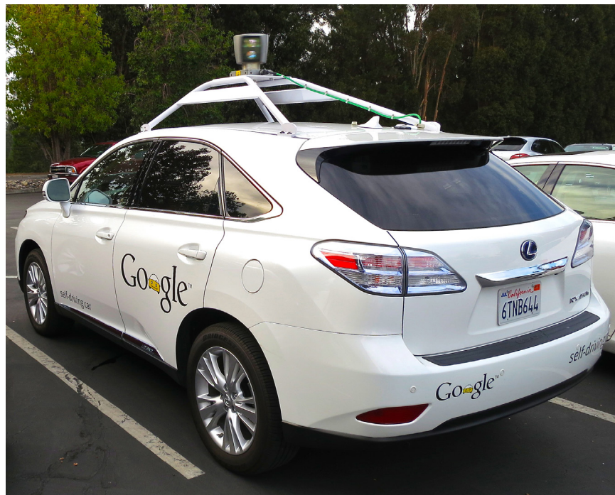
Lexus RX450h retrofitted by Google for automated driving

that part of the confusion arose because the different developers and manufacturers were talking about radically different vehicle automation system concepts when using the same imprecise terminology.