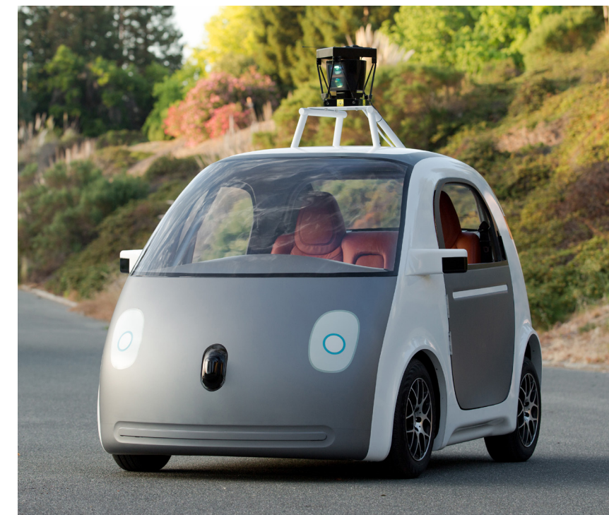
Google's most recent prototype automated vehicle concept does not include traditional driver's seat or controls

One topic of particular importance to the DMV was investigating the alternative models of safety certification. In the U.S., vehicle manufacturers self-certify that the vehicles they build meet the Federal Motor Vehicle Safety Standards (FMVSS), but currently there are no FMVSS for automated vehicles, nor are there any SAE or ISO voluntary standards for automated vehicles. PATH investigated models of safety certification used in the rail industry, by the EPA, and even the third-party safety process certifications commonly used in the European automotive industry. Although each certification model has advantages and disadvantages, there is no clear best solution.