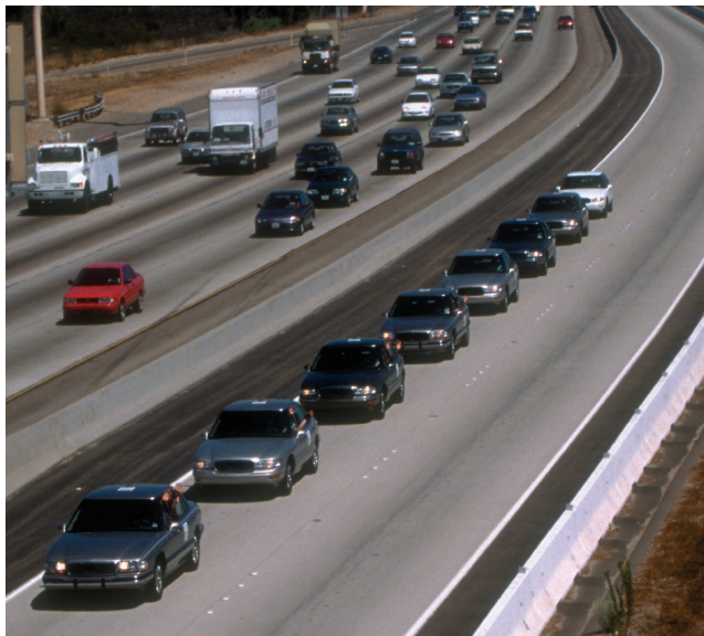
NAHSC 1997 Demo in San Diego

This Congressional mandate, which unfortunately was not accompanied by a dedicated funding stream, led to a large upsurge of national activity on highway automation. PATH was an active participant with several of the teams that won projects under the FHWA Automated Highway System Precursor Systems Analysis program in 1993-4, and was also a partner with Honeywell, developing operational concepts for the initial study of the human factors issues associated with automated driving. When FHWA solicited proposals for a national consortium to develop and test a prototype automated highway system, PATH and Caltrans had such unique qualifications in this field that they were the only organizations chosen to be on both of the teams that competed for that national consortium, one led by General Motors and the other led by TRW and Ford. The General Motors-led team won that competition and became the National Automated Highway Systems Consortium (NAHSC). PATH was one of the nine core participants in the NAHSC and had the largest single share of the NAHSC work of any of the participants (about 25% of the labor, representing about 30 full-time people).