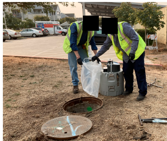
Figure 2. Staff prepare to deploy an automated composite sampler at UC Berkeley.

Δ Different sites sampled at different frequencies, number in table denotes most common frequency across sites. ΔΔ Number of sampling sites varies.