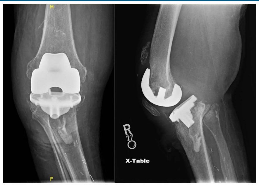
Preoperative AP and lateral views demonstrating the right knee pre-MKU. MKU = modular knee arthrodesis